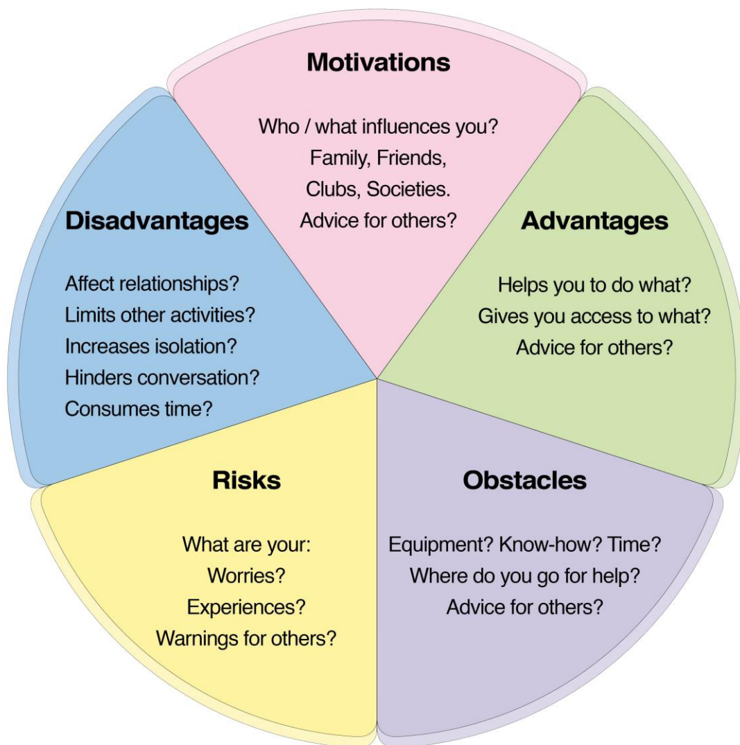
Figure 2 Wheel with areas of interest and prompts to serve as an interview guide

to evaluate the effectiveness of the wheel versus a semi-structured interview protocol or as complementary to the protocol.