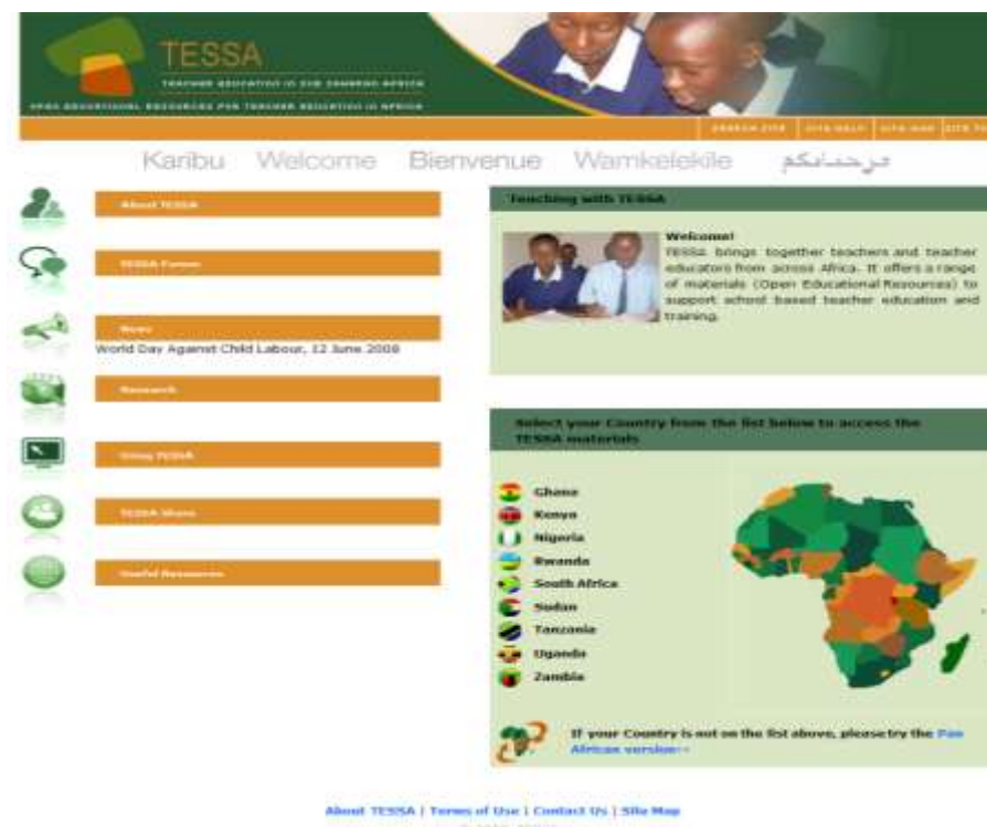
Figure 1: Screen capture of TESSA portal landing page in 2008

which aimed to: create a bank of ‘open content’ multi-media resources in on-line and traditional text formats that will support school based education and training for teachers working in the primary education sector; develop ‘open content’ support resources for teacher educators and trainers who will be planning, implementing and evaluating the use of the resources developed above; effectively extend and widen the take-up and use of the TESSA resources and ideas across SSA; and implement research activities that would promote the improvement of teacher education generally, in particular school based teacher education in SSA. The programme was established as a result of more than ten years of co-operative partnerships undertaken through a variety of projects that were consolidated to form TESSA’s founding consortium partner network of 16 institutions in 9 countries. By the end of the initial phase, over 100 academics and over 1,000 teachers had been involved in the design of the programme. The bank of open content resulting from all this activity was accessible through a portal (Figure 1).