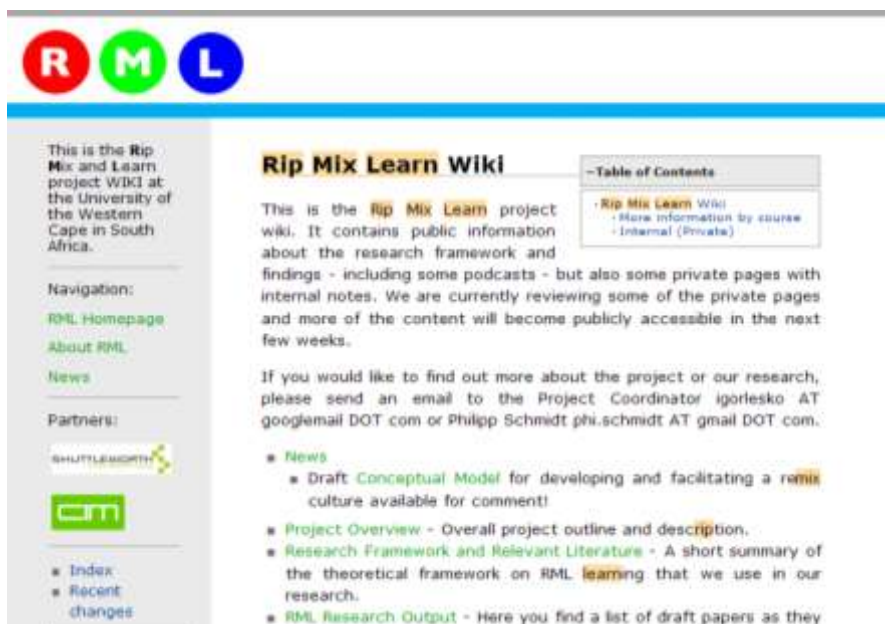
Figure 3: Screen capture in 2012 of Rip-Mix-Learn wiki

The Rip-Mix-Learn project was launched as a practice based research initiative at the University of the Western Cape from June 2007 to May 2008. It was one of a handful of OER initiatives in the world that looked at the role of student involvement in the creation of OER (Figure 3). The components of the title refer to the approach adopted to generate the OER and the pedagogical implications for students when doing so. "Rip" refers to locating the digital materials to incorporate. "Mix" refers to the digital tools used to manipulate the digital information. "Learn" in this context refers to what happens when students, as 'Ripper-Mixers', use Web 2.0 applications to actively produce their own knowledge, rather than being passive consumers of information prepared for them.