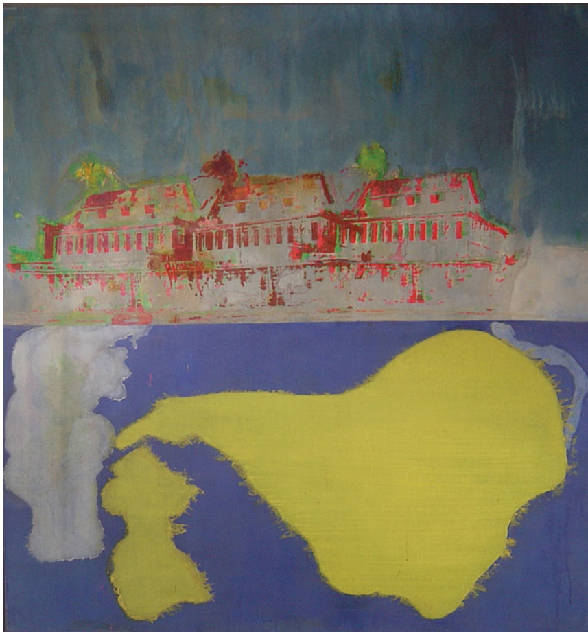
Figure 1. Frank Bowling, Mother's House (1967), acrylic on canvas, 157.5 × 167.6 cm.

were British artists with American popular culture that often commentators have needed to remind gallery-goers of the sequence in which interest in pop grew. Brauer et al. write of pop's transatlantic historiography,