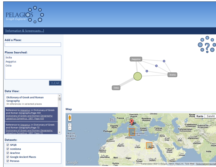
Fig. 1. Exploring Places Related Through Data.

of references to that particular place, in that specific dataset. As a consequence, a connecting line that has a width close (or equal) to the size of the dataset bubble will indicate a case where most (or all) of the references in the dataset are to this one place, and only few (or no) other places are referenced in this dataset. This way, users can quickly identify datasets that are primarily about this place, versus datasets where the place is referenced in isolated cases only. If, in addition to a relatively wide line, the bubble is small (representing a dataset with a low number of place references total), users will furthermore know that they are looking at a very specific, small set of data – such as a single page in a book – primarily about this place; and that this dataset could be worth looking at in more detail. A click on any dataset will bring up a list of the place references and accompanying metadata (including links to the actual origin data) in the Data View side panel on the left.