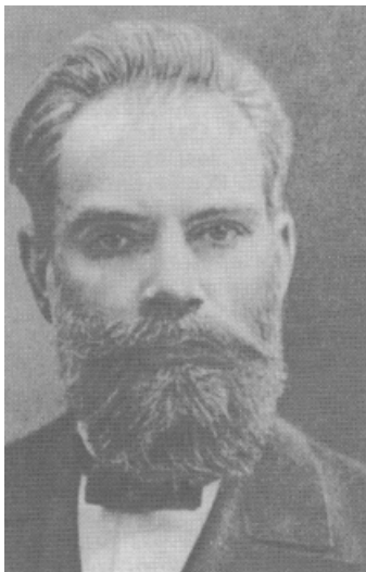
Fig. 1. A. M. Lyapunov

“If there exists a Lyapunov function, then the origin is a stable equilibrium point. If the derivative of the Lyapunov function is negative, then the system is asymptotically stable.” Unfortunately, however, finding an appropriate Lyapunov function can be very difficult, and failure to find one gives no information at all about the stability or otherwise of the system!