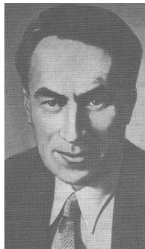
Fig. 2. A. A. Andronov

In 1931, for reasons that are still not quite clear, Andronov and his wife moved to Gorkii, 600 km east of the capital, although he appears to have retained a part-time paid position in Moscow. Whatever the reasons for the move, Andronov built up an extremely successful research group in Gorkii, while continuing to maintain and develop further his close links with Moscow.