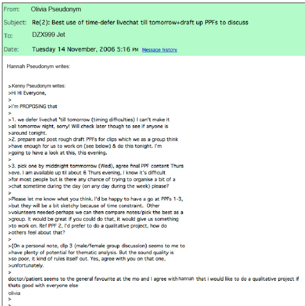
Figure 3: Posting 3. All text in the body of the posting appears as black text on a white background

In Posting 2, if Hannah presented both proposals and responses in the default 10pt Arial black typeface, it would take a lot of work for readers to develop a reading path through her posting that would distinguish her contributions from Kenny's quoted input. Figure 3 shows the next posting in this thread, which demonstrates how much extra work is involved for readers if clear reading paths are not established. At first glance it is not at all clear who is the author or which new text has been added to the discussion.