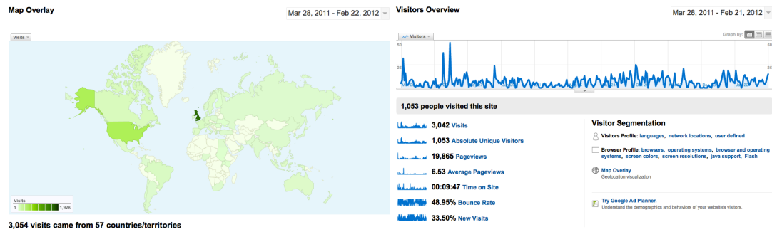
Figure 3. Main Google Statistics on EH visits

Moreover, 299 OER projects and organizations have been added to the Evidence Hub; 129 research claims have been proposed, 79 OER issues and 89 proposed solutions have been connected.