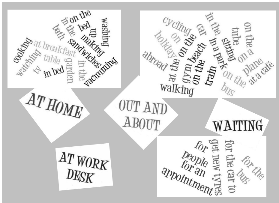
Fig. 1.2. Places where mobile language learning happens