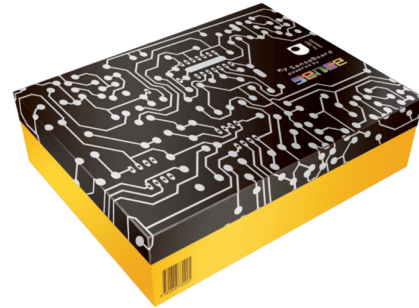
Figure 2: The SenseBoard box.

The usefulness of an ‘experiment kit’ that allowed students to build their own ubicomp devices was unarguable, but it could only be justified if it would not place an undue financial burden on the university or the student. This necessitated developing a low-cost, yet powerful experiment kit. After several iterations of the design, the final cost of a boxed SenseBoard kit is approximately US$70 when ordered in bulk.