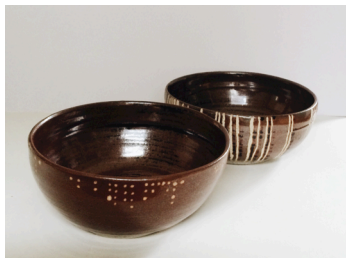
Figure 5. Cereal bowls representing Skype-call history with parents.