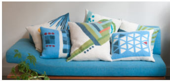
Figure 2. Felted pillowcases by Kim Rees visualizing dreams and personal accomplishments [10].