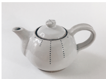
Figure 6. Teapot visualizing instant messages containing the word "love".