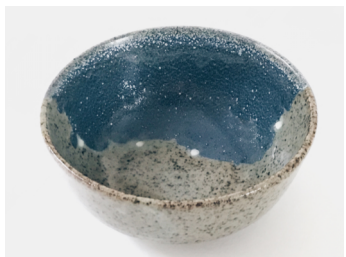
Figure 7. Bowl showing route of a shared trip with a friend.

dotted line represents one year; one dot stands for 10 messages. The visualization shows the progression from a long-distance relationship where the couple often expressed their love through texts, to recent years when living together allowed them to communicate directly. Alice: "I chose a teapot for this memento because it is a shared object that allows us to have a cup of tea together while pondering the development of our relationship."