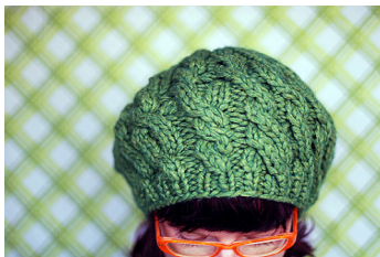
Figure 3. Conceptual knitting creates patterns from real world occurrences. This hat shows different events during the TV-show "Saved by the Bell" [4].

important relationships and aid people in the construction of meaning and identity through personal and joint reminiscing [2]. Access to unprecedented amounts of data about people's lives provides a potentially rich resource for reminiscing. However, sharing such data with others and deriving meaning from it is still a challenge [11]. For example, while people sometimes print digital photos, giving quantitative data (e.g., communication or location histories) a physical presence at home and making it accessible to all family members is more difficult. Previous research has highlighted integration with everyday practices and discoverability [5,8,9], permanence [7], and authenticity [6,7,9] as important qualities of physical mementos. However, we still lack means to create mementos from digital data that incorporate these characteristics.