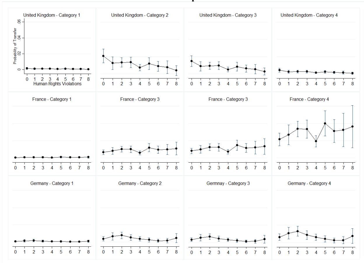
Figure 3: Marginal Effects of Human Rights Violations on the Probability of Transfer with 95% Confidence Intervals and Other Variables Held at Mean – Air Weapons

confidence intervals we find there is separation at higher levels of human rights violations between categories one and two along with one and four. A similar substantive effect across categories at similar level violations does not support the hypothesis.