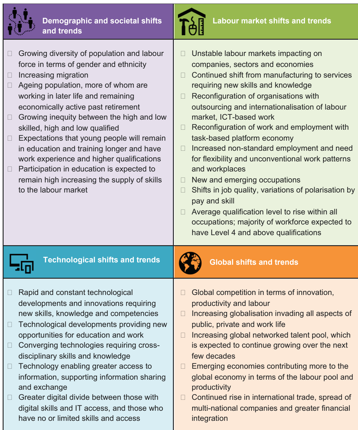
Table 1 Overview of demographic and labour market shifts

Sources: de Hoyos et al., 2013; Eurofound, 2015; Huws, 2015; OECD, 2016a; OECD, 2016c; OECD, 2015b; Paccagnella, 2016; Störmer et al., 2014; UKCES, 2016; Warhurst et al., 2016; Wilson et al., 2016