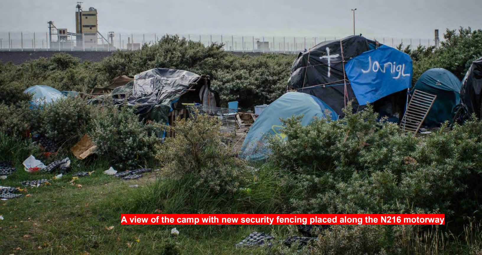
A view of the camp with new security fencing placed along the N216 motorway