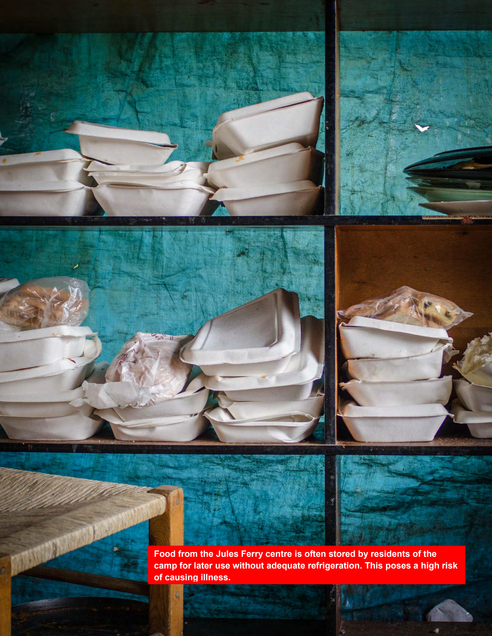
Food from the Jules Ferry centre is often stored by residents of the camp for later use without adequate refrigeration. This poses a high risk of causing illness.