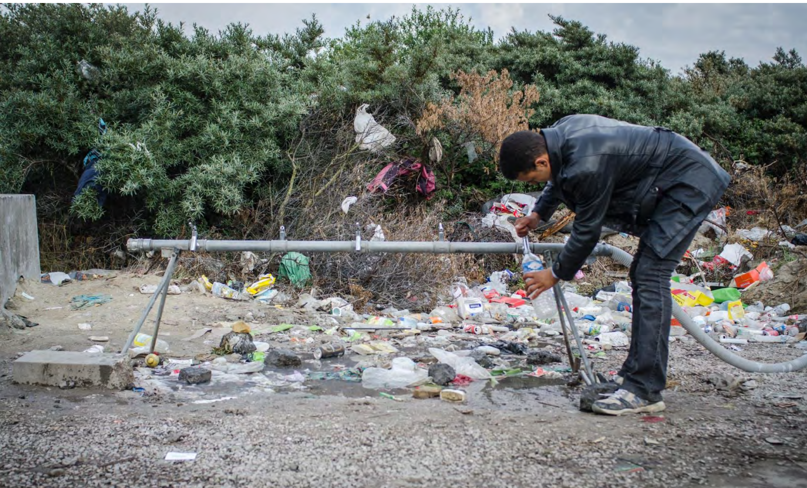
A resident of the 'new Jungle' fills his water bottle at one of the five water points.

Of key concern is the widespread use of old chemical containers for transporting water, which presents a potential health hazard as these are not designed to carry drinking water and may also be contaminated with residues of their previous contents. There were several containers in use with 'corrosive' labels intact. There is also no way of effectively cleaning and disinfecting the containers that the residents are using.