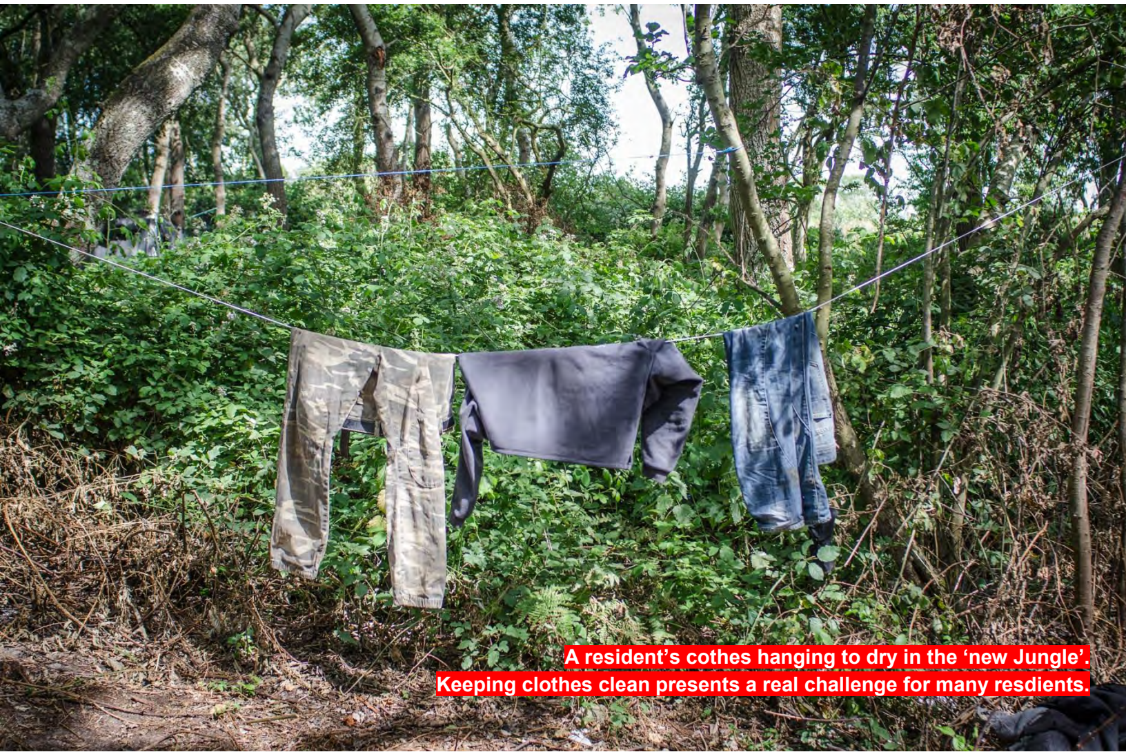
A resident's clothes hanging to dry in the 'new Jungle'. Keeping clothes clean presents a real challenge for many residents.

Whilst there are some laundry facilities within the Jules Ferry Centre which are open from 12.30-3.00 daily, these appeared to be used only by a minority of residents. Many residents reported washing their clothes in cold water from the piped site facilities, and this was also observed during the visit. There were reported difficulties in procuring washing liquid to adequately clean clothes. All residents who took part in the research described their inability to keeping bedding