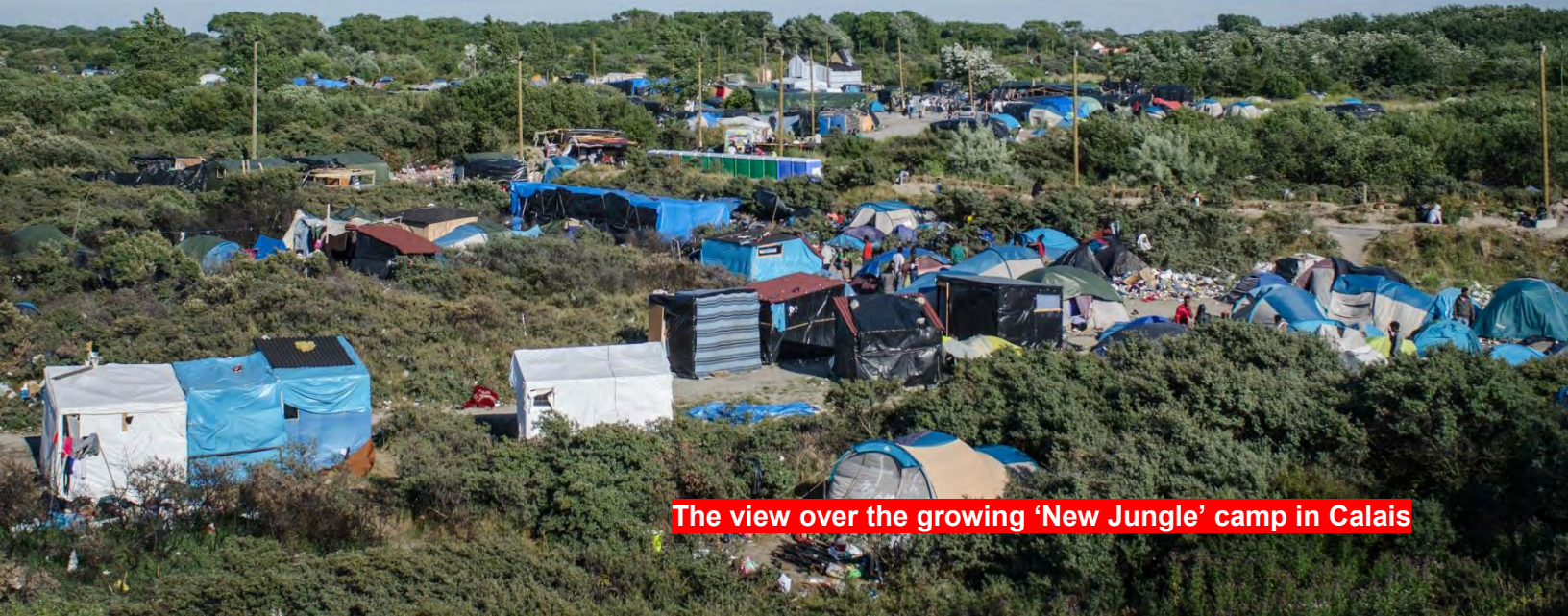
The view over the growing 'New Jungle' camp in Calais

This report provides preliminary results from an environmental and public health survey of the informal Calais migrant camp in April and July 2015. Testimony and reportage from NGOs and journalists have raised grave concerns around the living conditions of migrants in the camp. Responding to anecdotal reports of acute illness, injury and conditions detrimental to the health of migrants, the research provides the first independent scientific study of living conditions in the migrant camp and their likely impacts on health.