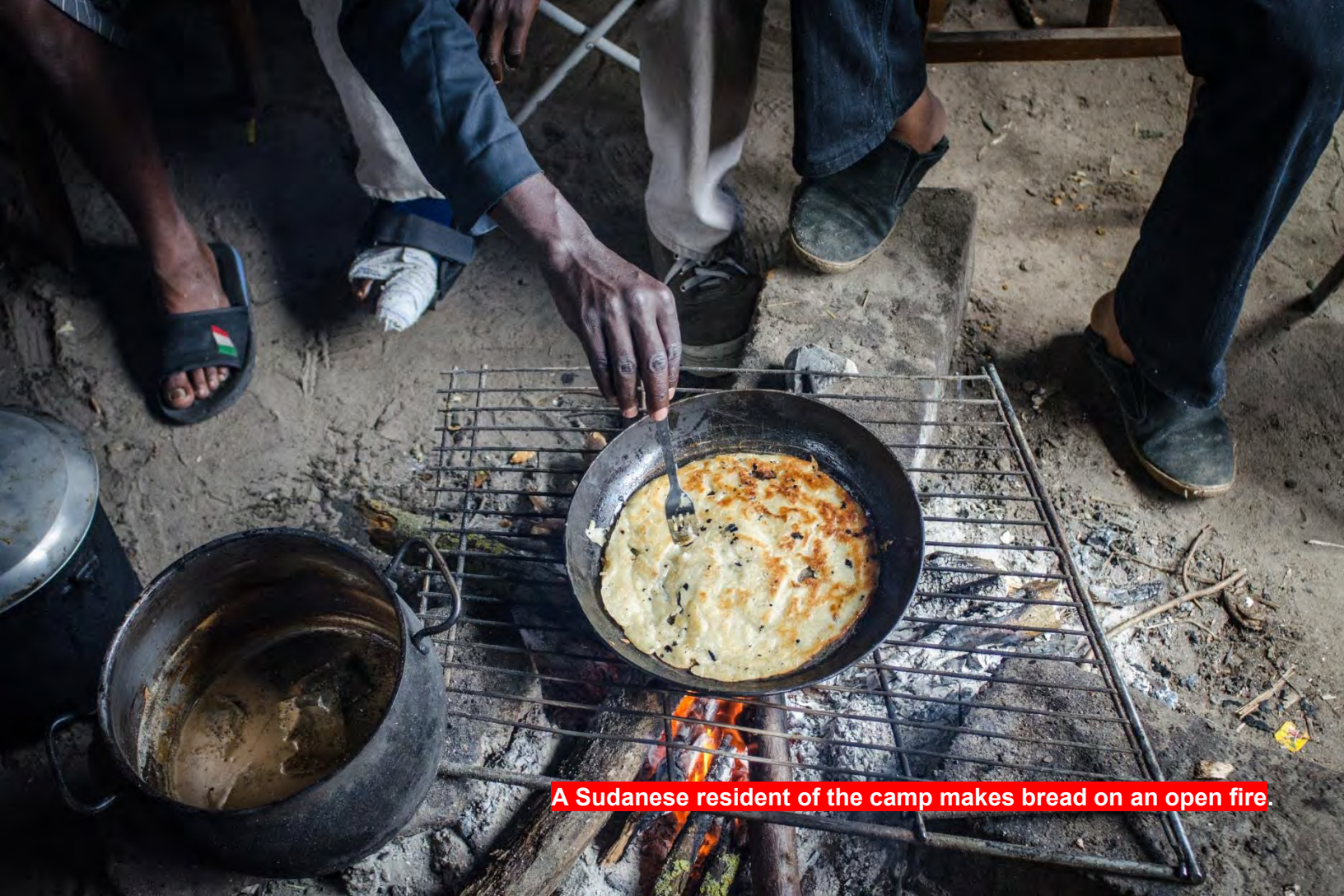
A Sudanese resident of the camp makes bread on an open fire.