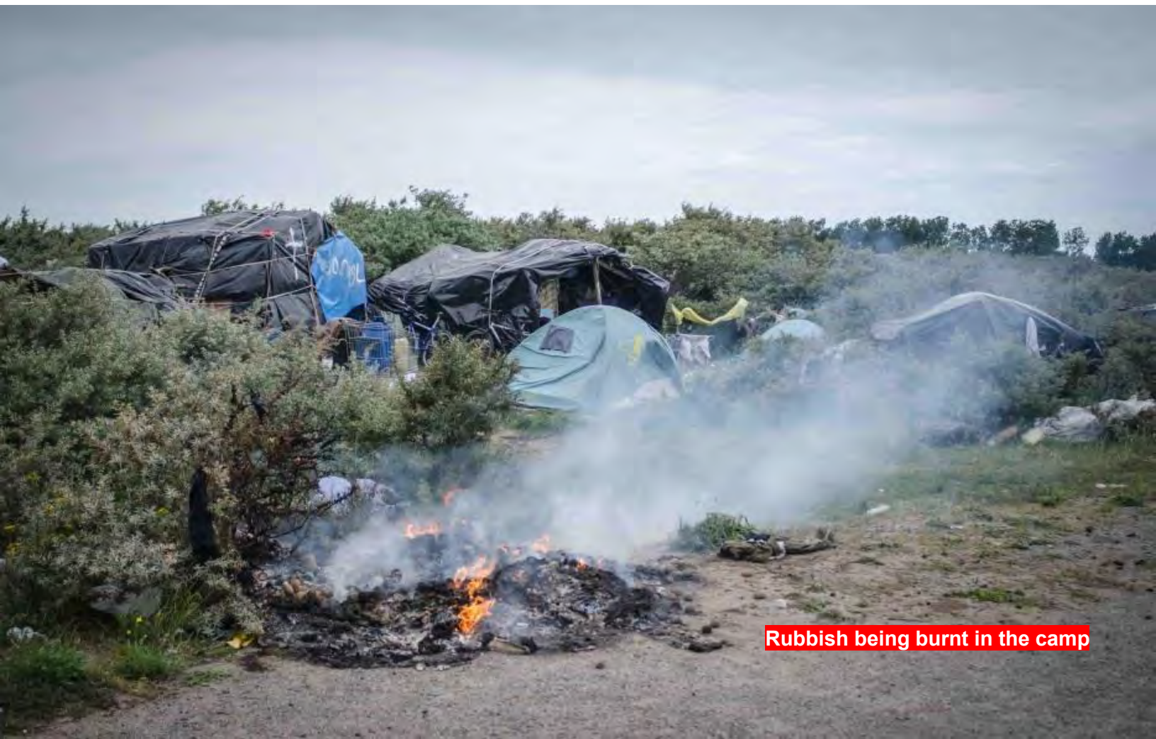
Rubbish being burnt in the camp

relatively isolated. The residents who live in these areas are often more in need of basic provisions. Whilst hunger is experienced across the camp as whole, southern sections of the camp in particular, groups were more likely to be severely short of food - and this observation was consistent between site-visits in April and July 2015.