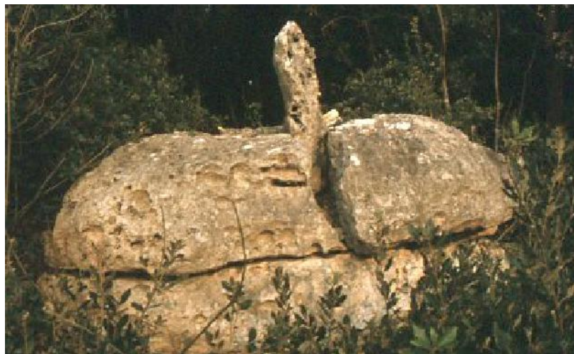
Figure 7. The two standing stone located near the southern wall of the building in figure 3. The stones are 44 cm apart.

About 30 m southeast from the casella is located a large rocky outcrop characterized by a fracture some centimetres wide and several centimetres deep, cutting through the hole outcrop. This is at the edge of a steep slope facing east toward the upland plain of the Mànie. The fracture hosts an isolated standing stone with a hole in its top end (fig. 7).