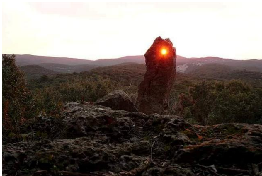
Figure 9. The point of light created by the sun when observed through the hole from some distance from the stone and at the equinoxes' sunrises.

Measurements taken with a prismatic compass Wilkie of the horizontal arch visible through the hole when the compass sight is placed against the hole (e.g. fig. 8) is 74^{\circ} - 93^{\circ} .