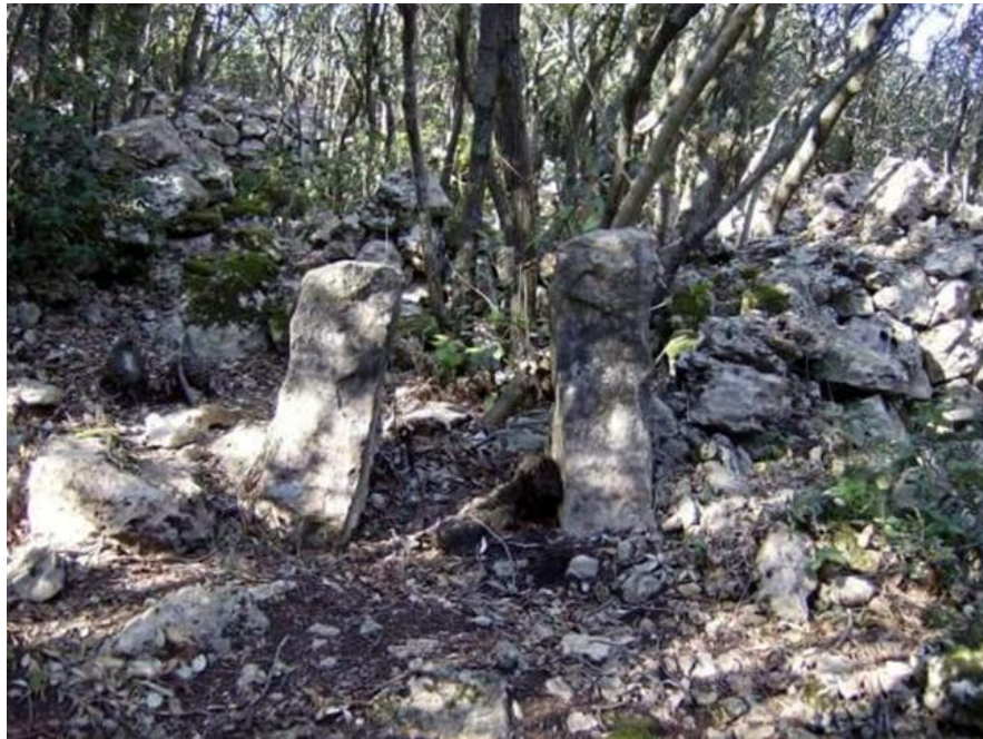
Figure 6. Standing stone vertically fitted in a natural fissure of the rock with a natural hole in its top end. This stone is about 30 meters away from the building in figure 3.

About 30 m southeast from the casella is located a large rocky outcrop characterized by a fracture some centimetres wide and several centimetres deep, cutting through the hole outcrop. This is at the edge of a steep slope facing east toward the upland plain of the Mànie. The fracture hosts an isolated standing stone with a hole in its top end (fig. 7).