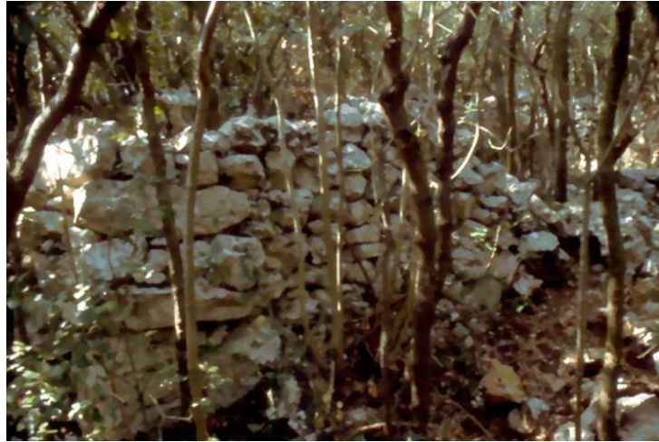
Figure 5. East wall of the "casella" built without the use of mortar (copyright Mario Codebò).

Walls are preserved for up to 2 m above the ground and are made of stones of various sizes, laid without mortar (fig. 5). Stones were sourced locally and used without specific preparation. Stone alignments within the walls are irregular and characterized by a high number of voids. Cornerstones are generally bigger than the other stones. Overall, the building technique can be described as inaccurate and attributed to non-specialized builders.