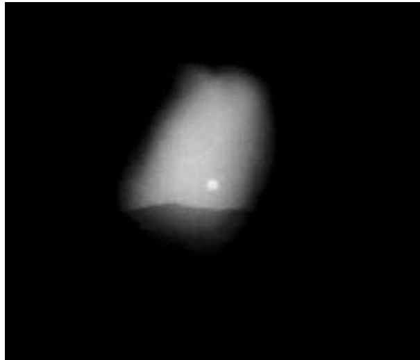
Figure 8. The sunrise on 23 rd March 2003, photographed with the camera's lens against the hole.