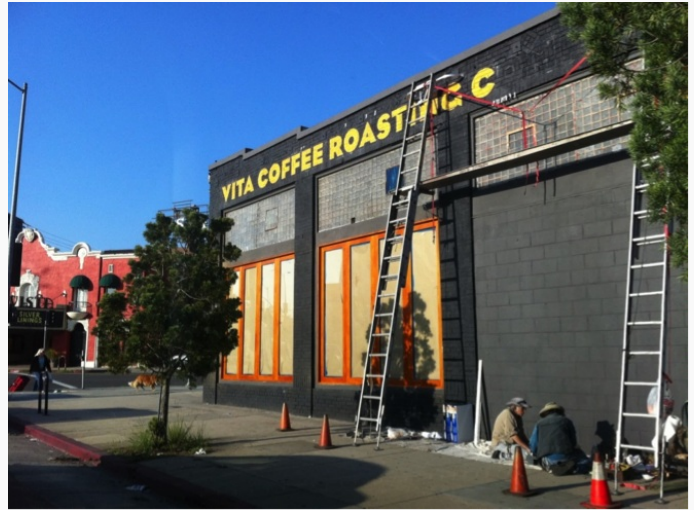
Workers putting the finishing touches on a new artisan coffee shop on Silver Lake's western border.

place – buildings changing from one use to another, shops changing hands, and new businesses popping up. In gentrification, there is typically an ‘aesthetic’ associated with this process (see Bridge, 2006), and this was something I tried to document since it is truly a visual change in the landscape. One day as I crossed into Silver Lake from neighbouring Los Feliz I noticed the final touches being put on a new coffee shop, clearly showing examples of this aesthetic. The building had held a variety of businesses over the years but remained a non-descript looking building without much character. It was receiving a make-over with a clean font title, style, and colour scheme that better represented the aesthetic of an up-and-coming neighbourhood – this is besides the fact that an abundance of coffee shops in a neighbourhood often signals gentrification in its early stages. This new establishment, and the abundance of similar ones in surrounding locations, became useful in photographs as I could track the visual changes taking place in the landscape that were representative of gentrification.