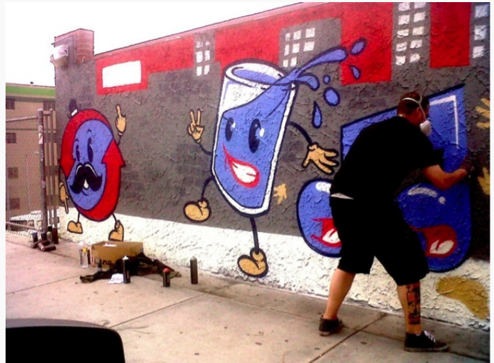
Observing change as it happens: Documenting a local graffiti artist from the passenger seat of a car, as he created an advert for the 1st annual Silver Lake Jubilee, in 2011.