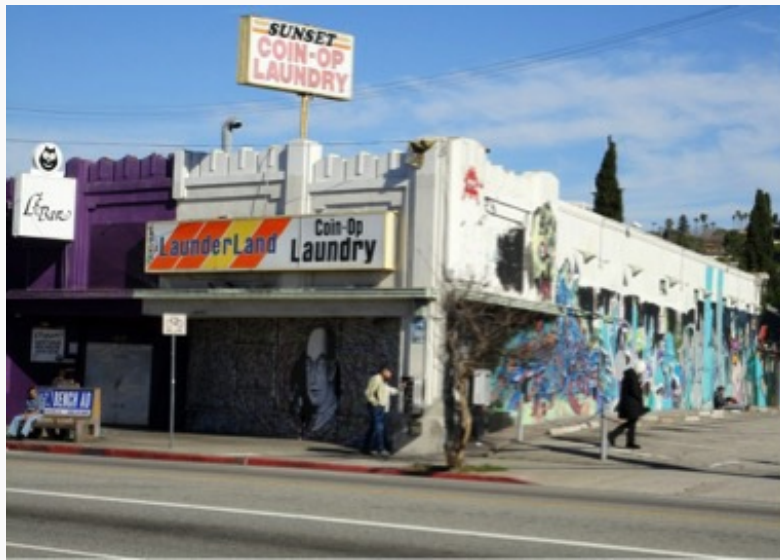
Site of Le Barcito and neighbouring mural covered Laundromat, before the insertion of a new trendy gastropub (Photograph by Juliet Kahne, 2011)

Another issue I encountered in photographing Silver Lake that I had not taken into consideration before fieldwork was how much the area would change once arriving to the research site, and how quickly. There were occasions where I captured evidence in the landscape of cultural continuity and a lack of new developments and businesses that often signal gentrification, which were to demonstrate how Silver Lake managed to limit unwanted development. However, this continuity was short lived. In the case of Le Barcito and the LaunderLand next to it on Sunset Boulevard in the heart of Silver Lake, I had captured a long standing gay bar with historic political status and its surrounding environment covered in murals by local artists. Within the next few months, a hip restaurateur purchased LeBarcito. He turned the corner into a gastro pub with expensive food and a complete renovation of LeBarcito's historic interior elements. What I initially saw to be a strong example of community activism and political support ended up making little difference in the face of change moving across the neighbourhood. Though at the time my photograph captured something culturally significant and consistent about Silver Lake's cultural evolution, it was only very soon after that this significance was no longer relevant. Therefore at first sight, my observations and documentation was supporting my hypothesis, only to then change very shortly after.