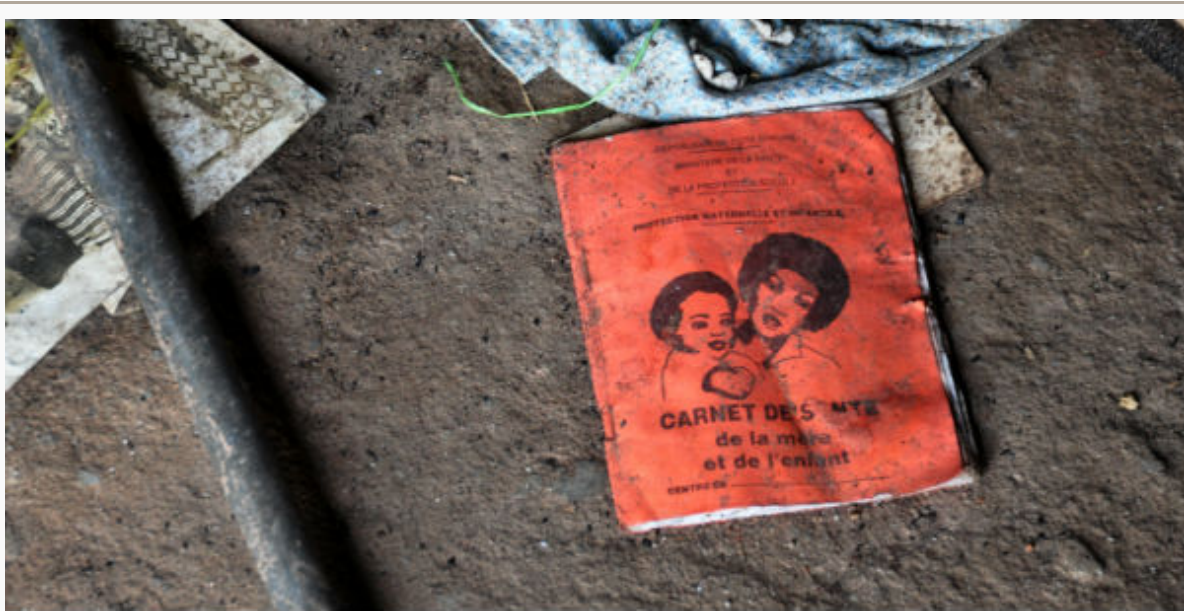
A health record book left in the Quartier Guere district of Duekoue, Cote d'Ivoire, February 2011. Local people, most of whom were supporters of the incumbent president Laurent Gbagbo, were driven out by forces loyal to Alassane Ouattara.