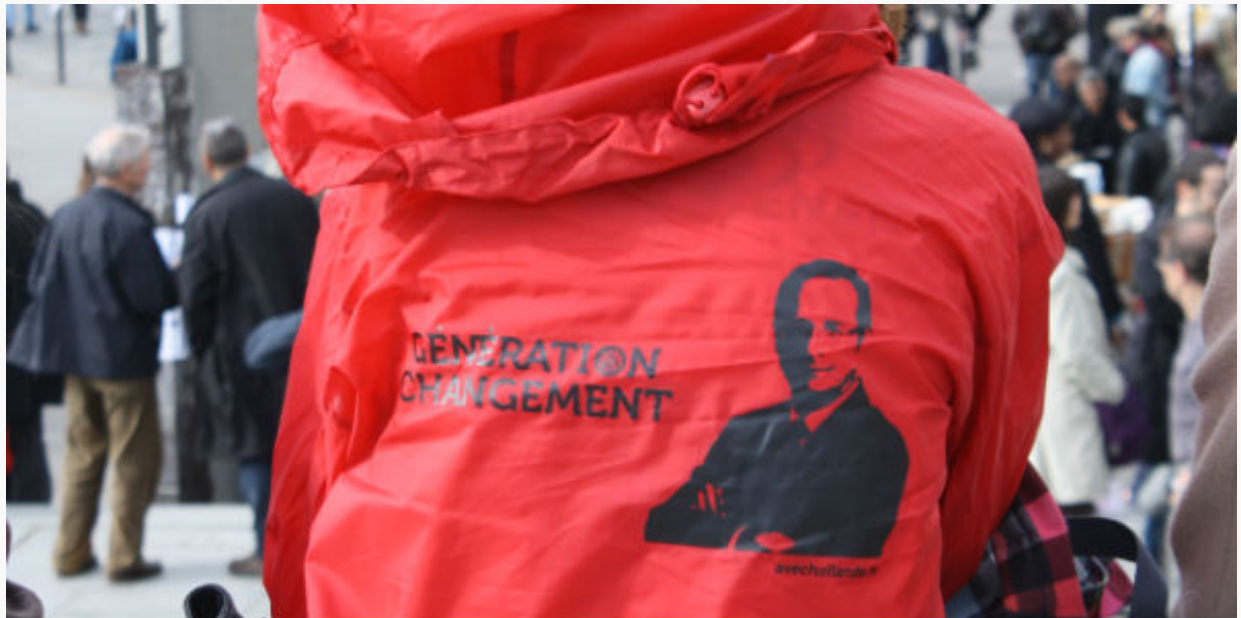
A woman wears a Génération Changement raincoat featuring François Hollande before the 2012 presidential elections.