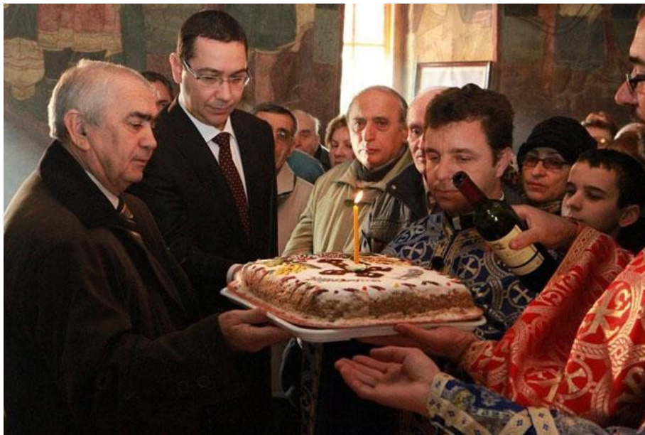
ImpactinGorj.com – Ponta distributing Pomana. Electoral Pomana is the practice of giving material gifts to voters in return for their support.

However, it failed, in one example PSD supporters openly campaigning in the Orthodox Church with the support of the Priest in Paris were heckled in a video that then went viral .