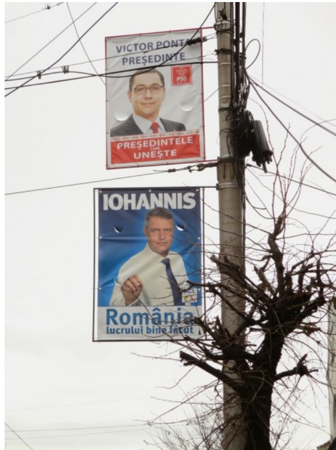
Top: Victor Ponta President – the president who unites; bottom: Iohannis – Romania, work done well

“Mândru că sunt român ortodox” / “Proud to be Romanian Orthodox” Victor Ponta, Romanian Prime Minister and PSD Presidential Candidate