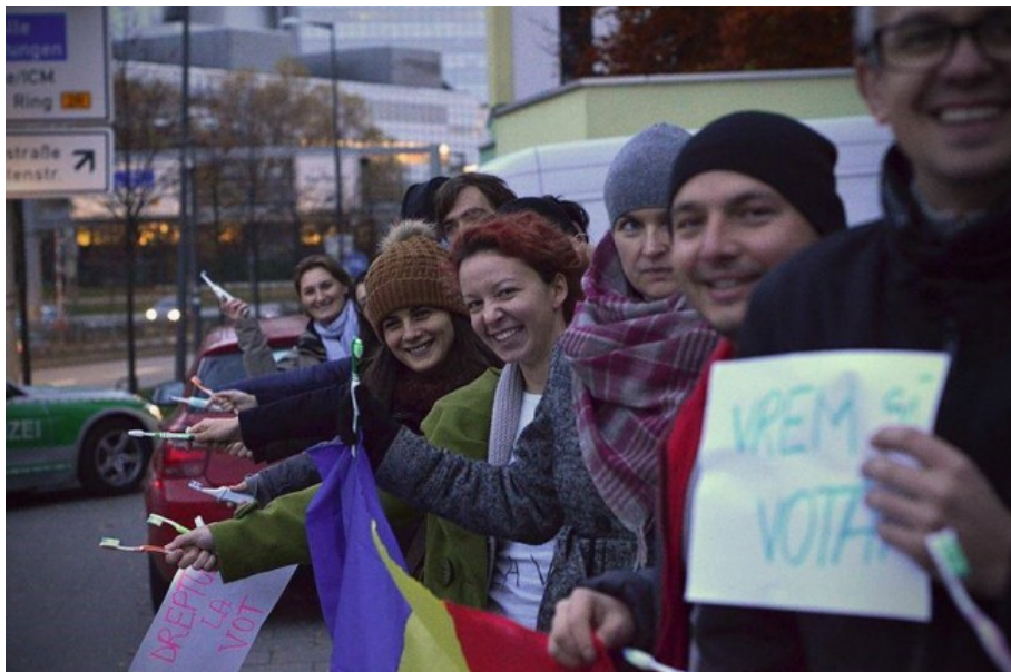
Voters queuing on Saturday evening before the polls opened on Sunday in Munich (source: Madalina Rosca via Facebook)

Angry voters outside the Romanian Embassy in London shortly after the Embassy Staff shut the doors on voters waiting to cast their ballots during the first round. Video courtesy of Ioana Dumitrescu