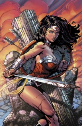
Wonder Woman by David Finch

And just recently, a new artist and writer took over the main Wonder Woman title, David and Meredith Finch, respectively. Reviews have been mostly negative, criticizing the sexualization of the character as well as what seem to be out-of-character decisionmaking.