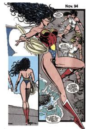
Wonder Woman by Mike Deodato

It seems as if there was such discomfort with the portrayal of strong female comic characters that their threatening nature had to be counter-balanced with exaggerated sexualization to remind us that women should be objects to be acted upon rather than identified with. Male superhero characters are idealized in terms of their musculature, certainly, and tend to be posed facing front and looking strong. Female superheroes, by contrast, tend to have their curves rather than muscles accentuated, and to be posed sideways or twisted to further draw attention to the curves.