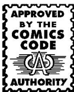
The Comics Code Authority Seal

But even in the digital age, queer comics are hardly restricted to the internet. Queer publishers such as Northwest Press have been steadily producing comics for years, and Prism Comics — a nonprofit organization that supports queer comics — even offers a yearly grant to help creators publish. And in recent years, creators have found plenty of new options for self-publishing, including raising money through Kickstarter , like recent successes Qu33r , Virgil , and The Young Protectors (which made nearly ten times its $14,000 goal), and allocating funds from Patreon .