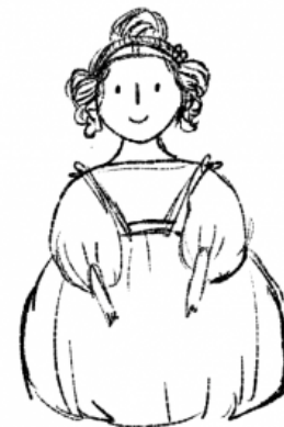
Wee Ada Lovelace – Kate Beaton

Superhero comics are the exception. While superwomen are more prominent than ever on the page, and even get to have a slight variety of body shapes and skin colours, the creator line-up at DC and Marvel – while improving – is still struggling to match the rest of the industry. One reason for this is perhaps restricted access that comics only available in a comic shop maintain – while webcomics can be found by anyone and graphic novels are prominent in book shops, only someone deliberately looking for Super Captain Ballerina #3 is going to find it. Digital distribution has gone some way to challenge that – Ms Marvel's digital sales in particular are testament to her popularity outside the regular superhero audience – figures are still ludicrously low in comparison to the number that pay to see superheroes beat up bad guys on the cinema screen or to be the Batman themselves in video games such as Arkham Asylum .