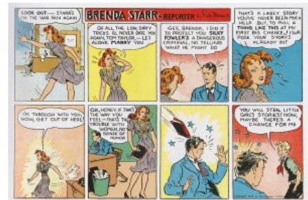
Brenda Starr – Brenda Starr, Reporter by Dale Messick, 1946

Digging into the history of Wonder Woman started me on a journey into the forgotten history of women in comics, and the many wonder women that came before Diana, both on and off the page; a forgotten history that very much ties into the tension within comics today. Before the appearance of Diana and her fabulous friend Etta Candy in the early ‘40s, there were a myriad of strong female heroes: the Phantom Lady, Sheena the Queen of the jungle, Torchy Brown, Brenda Starr, the Woman in Red, Fantomah, Miss Fury, and Red Tornado, the first female superhero, who disguised herself by wearing a cooking pot on her head (fashion!).