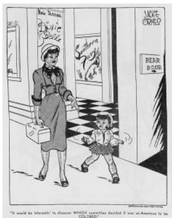
Patty-Jo n Ginger by Jackie Ormes, 1951

Superhero comics are still very much struggling to break free of their all-white, all-male, all-straight reputation. There may be fewer pendulous breasts on the covers, but they and their fellow direct market cousins have still got a long way to go. Let the past be a warning – we have been here before and things have gone terribly awry, independent female characters replaced with male-gaze fantasies and women creators forgotten. And shouldn't we have more women of colour working in action comics than we did in the '30s?