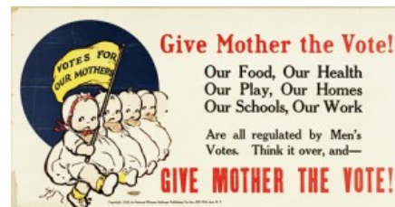
'Give Mother the Vote!', Rose O'Neill, Missouri History Museum, 1915

as gender politics, a radical accomplishment given her doubly reduced rights and visibility.