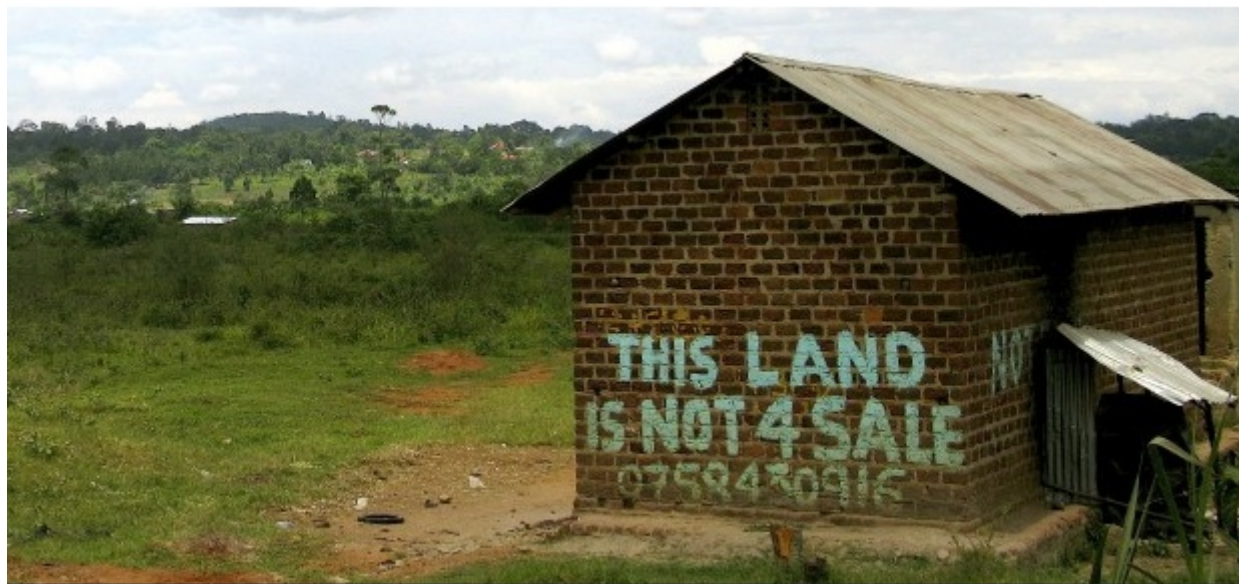
Trustland Research Project