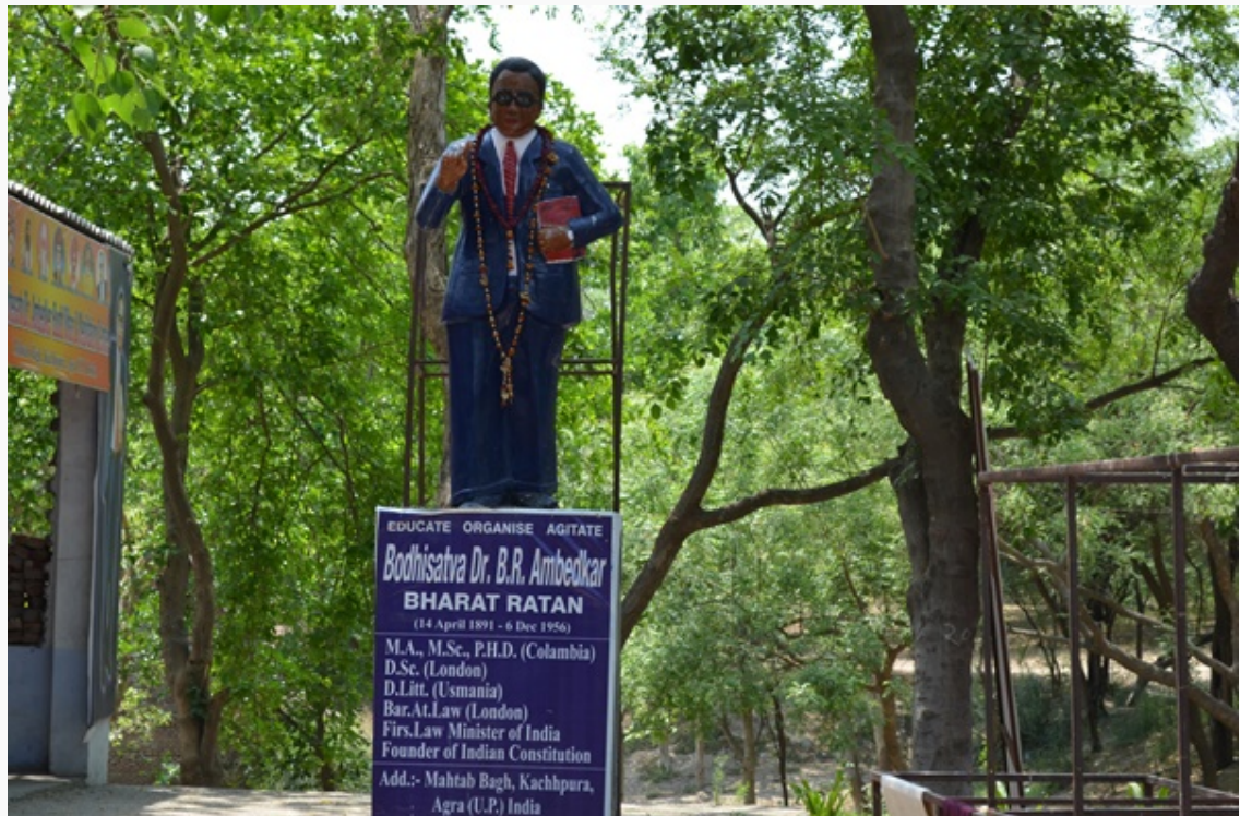
Image: B.R. Ambedkar, founder of the Indian Constitution.

The contemporary corpus of Indian law is peppered with jurisprudential remnants from the British colonial administration. Do you think that a reformulation of the Indian Constitution would afford the chance for Indian society to move beyond anachronistic laws like Article 377?