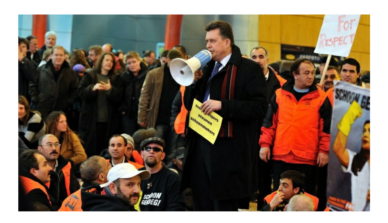
FNV sit-in at Utrecht central station, 2010.