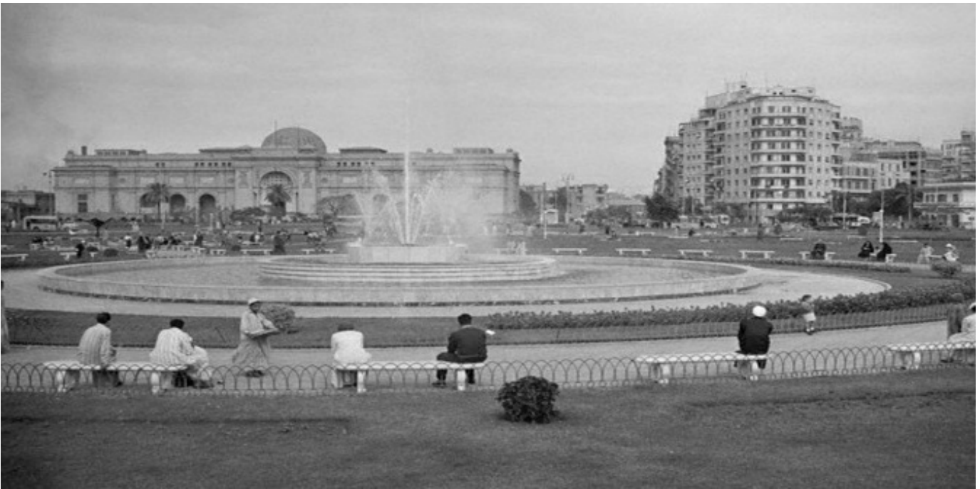
Image Credit: Tahrir Square, Cairo, circa 1940s (Wikipedia Public Domain)

Besides shedding light on the group's activities, Bardaouil charts AL's connections to the international network of Surrealists. The author calls attention to their shared anti-fascism and dissatisfaction regarding the bourgeois notion of 'art for art sake', but emphasises that AL did not partake in the Surrealist project without altering its texture. Through a meticulous analysis of previously unpublished correspondence, Bardaouil shows how AL, in contrast to previous claims (see, for example, Don LaCoss ), grew out of specific local concerns, leading them to disagree on urgent theoretical matters with movements including the International Federation of Independent Revolutionary Art (F.I.A.R.I.). Equally compelling is Bardaouil's assessment of the notions of 'subjective realism' (Rames Younane) and 'free art' (Kamil al-Telmisany), which emerge as part of the group's efforts at renegotiating Surrealism's conceptual parameters as well as, crucially, reinvigorating its call for revolution. For AL, as Bardaouil puts it: