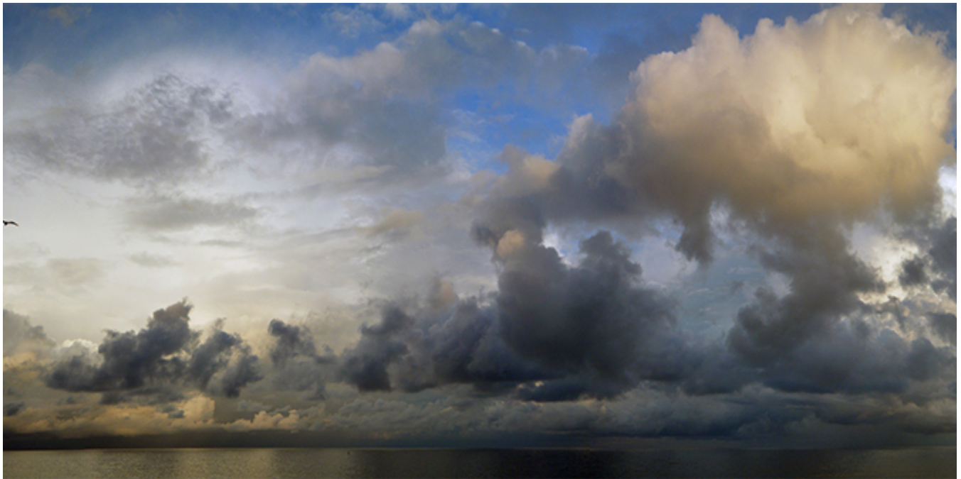
Low level clouds