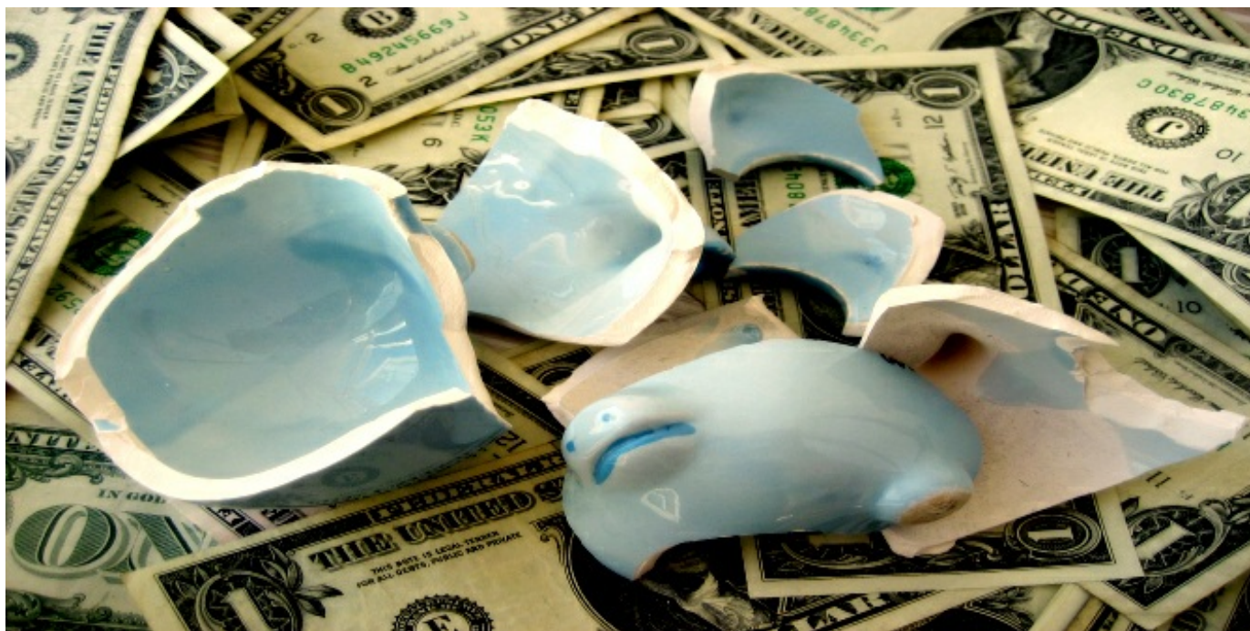
Broken piggy bank

poverty and what might be done about it. Section One contains the two most illuminating chapters.