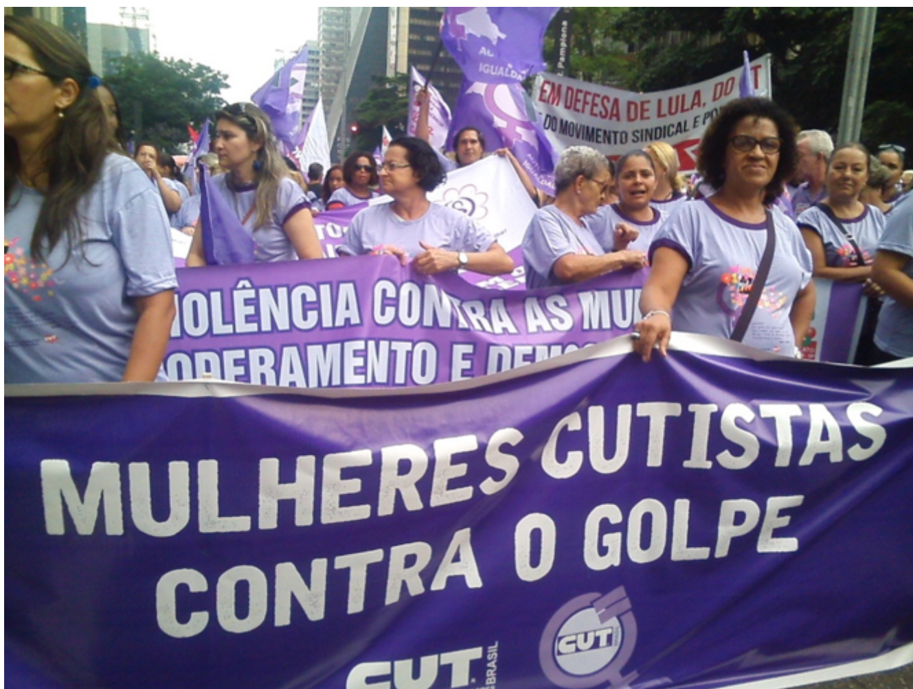
“Unionist women against the coup” – CUT is the Unified Central of Workers, affiliated to the PT

On the other hand, smaller leftist groups (see for instance the PSTU or the CONLUTAS ) wanted to dissociate themselves from a government which they consider to have betrayed its electorate to implement neoliberal policies. They also criticised the national corruption scheme and made banners saying “get rid of them all, enemies of women”, citing names of some politicians allegedly involved in the scandal.