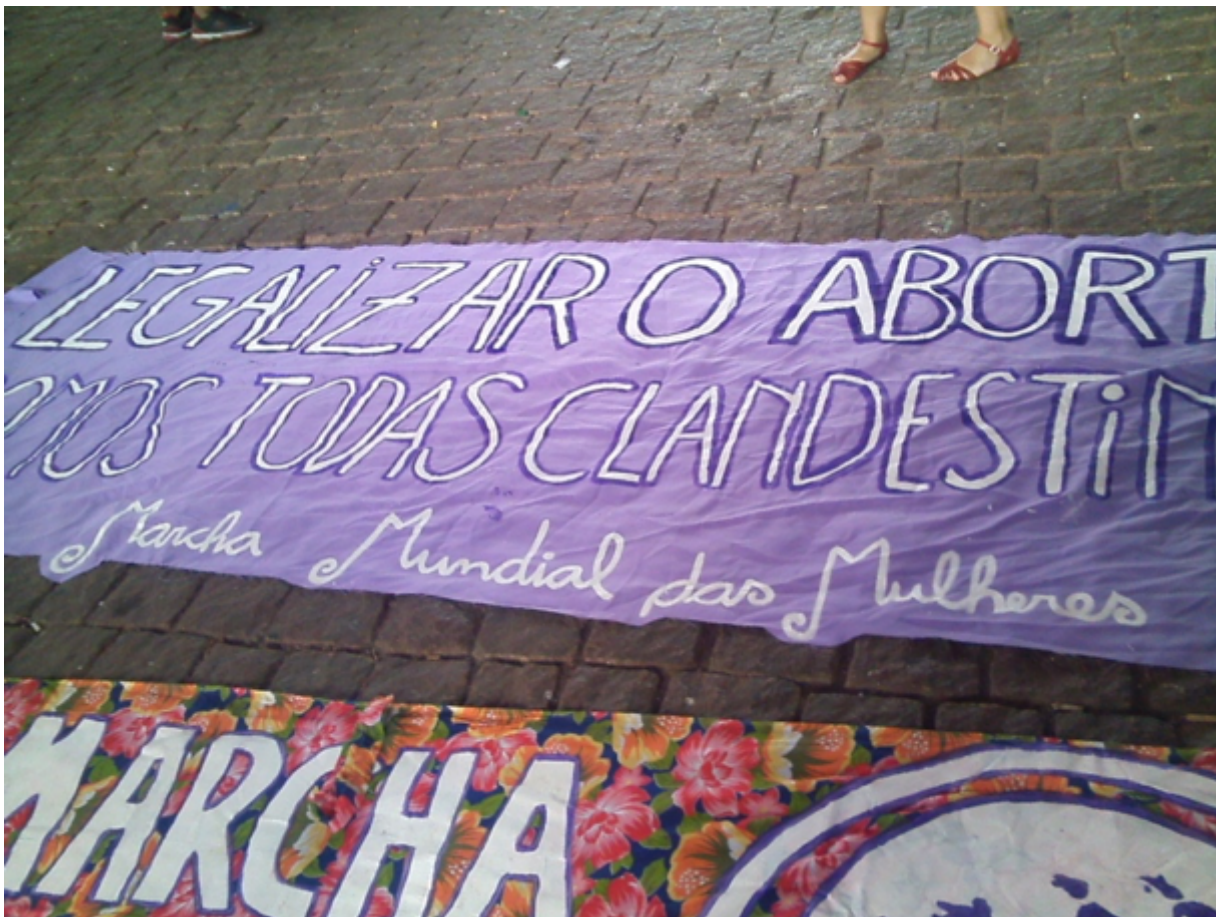
“Legalise abortion, we are all clandestine – World March of Women”

Aside from abortion, Brazil still faces significant challenges in terms of gender equality. Women are over-represented in sectors such as domestic work where they account for 93% of the working force; this represents 14% of all professionally active women and 22% of all professionally active black women. As for unpaid housework , women spend on average 27h a week on domestic activities, while men spend only 11h. The gender pay gap is 24%, and 49% of women have an informal job in the manufacturing sector compared to 31% of men. Women only represent 10% of the elected members of Parliament, ranking Brazil 154 th out of 185 countries.