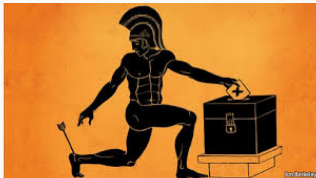
Europe's Achilles heel or not?

If there is a country, which should receive our apologies, that is Greece. We need to apologize for having demonized a small and modest economy (less than 2% of the EU GDP) as the black sheep of the European Union and the challenger to the abstemious efforts that the northern economies have parsimoniously done, over years of sacrifices. Right before the financial crisis of 2008, Greece and a number of smaller EU member states were completely ignored by the larger audience, as the study conducted by MediaTenor indicates. Greece was featured as a great place for vacation, a quite inexplicable winner of the European soccer games of 2004 and a layback country, which was enjoying more than others the newly gained prospects of a novel integrated European