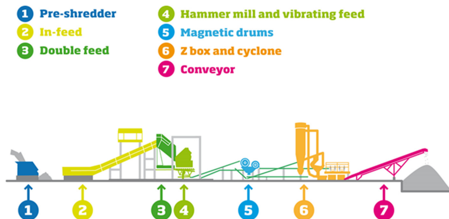
Fig. 1. Shredding plant layout of case study site.

A review was conducted of the thermal-processing plants available globally. Initially, all companies were included which had the potential to provide either biomass or waste thermal plants. These companies were subsequently evaluated to determine their potential suitability for use as an ASR thermal process technology provider. Initial screening of more than one hundred identified companies was carried out. This focused on the maturity of their