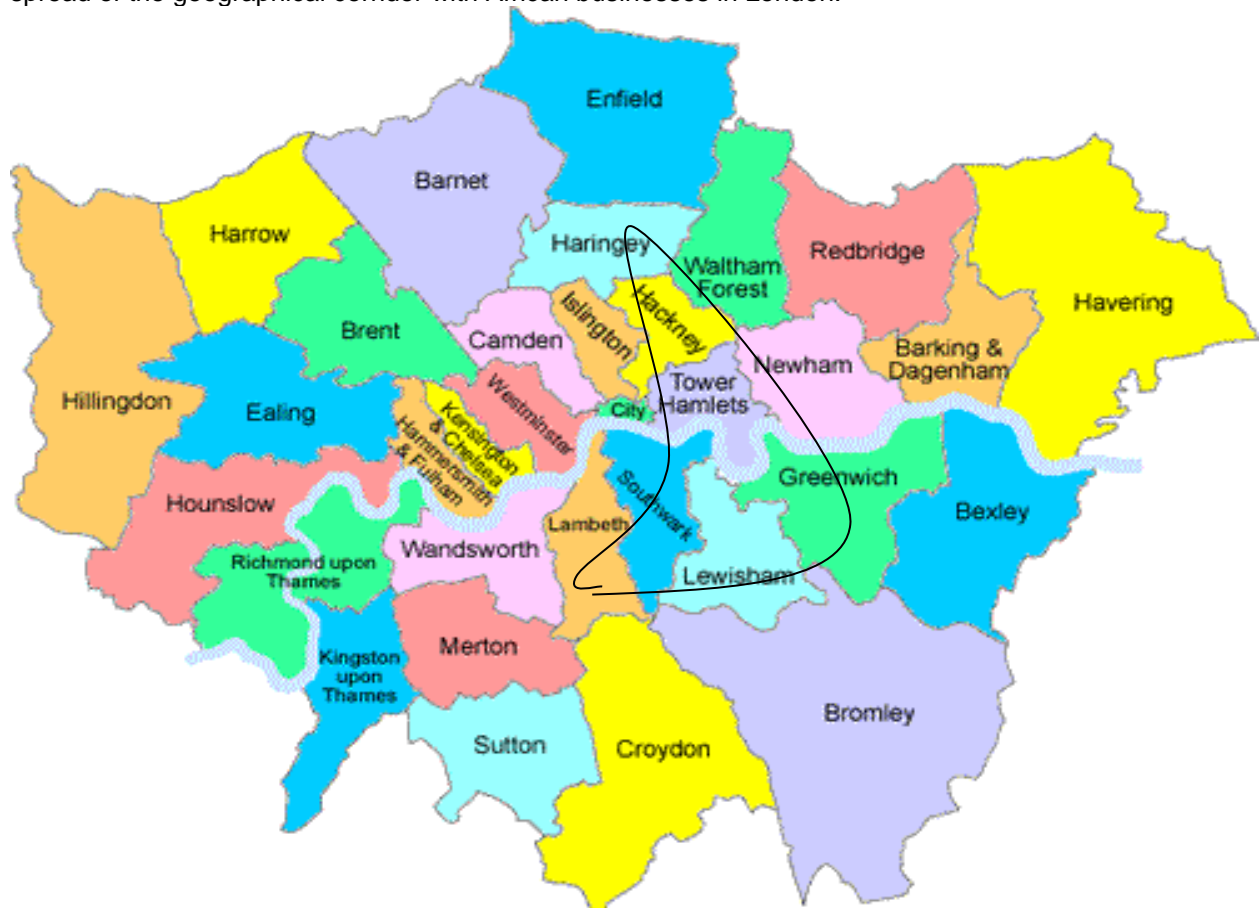
Fig. 3 Geo-ethnic corridor in London with strong Black African small businesses

businesses was five months (one business) and the longest was recorded as two years and six months for eight businesses, with the remaining 18 survived less than two years (Holland, 1998). There were naturally large numbers of African small businesses in geographical areas with strong Black African presence. In London, where this research was conducted, there seems to emerge a clear geocentric corridor from Lambeth, Lewisham, Southwark and Greenwich (South London) to Tower Hamlets and Newham (East London), and Hackney and Haringey (North London). These have the highest concentrations of Black Africans (Daley, 1998; Owen, 2001). Figure 3 below indicates the nature and spread of the geographical corridor with African businesses in London.