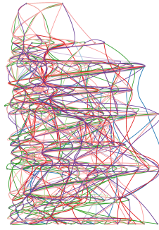
Figure 3: The beautiful mess feature of Poemage applied to Clark Coolidge’s “Machinations Calcite.” Development of this feature exhibited elements of reciprocal shaping (P3) and guided emergence (P6).

acetone imprinted oblique swatch on the skin car barn oil wall scornful & mumps much wet green I'd leave sole key to this game to my friend, sheet water cat actor impressed weaving candle turn on computer cigarette, paper wall barrels & balance a lot of yellow sick neck He'll have to hurry & carry away, to my blue friend hustling bringing his moon & car agate inked merry melodies drool on shank of wet lead star tool crayon & sands length of granite buck - drill It's sucking up the strand, his crystal flag, & the eels tube for that, their parade imitate fun arctic suck splinter dry - ice spazz lake - ing ace supper at church hard pink & sponge breath many forams drift Roller window going up on I repeat my offer food list in iron flakes