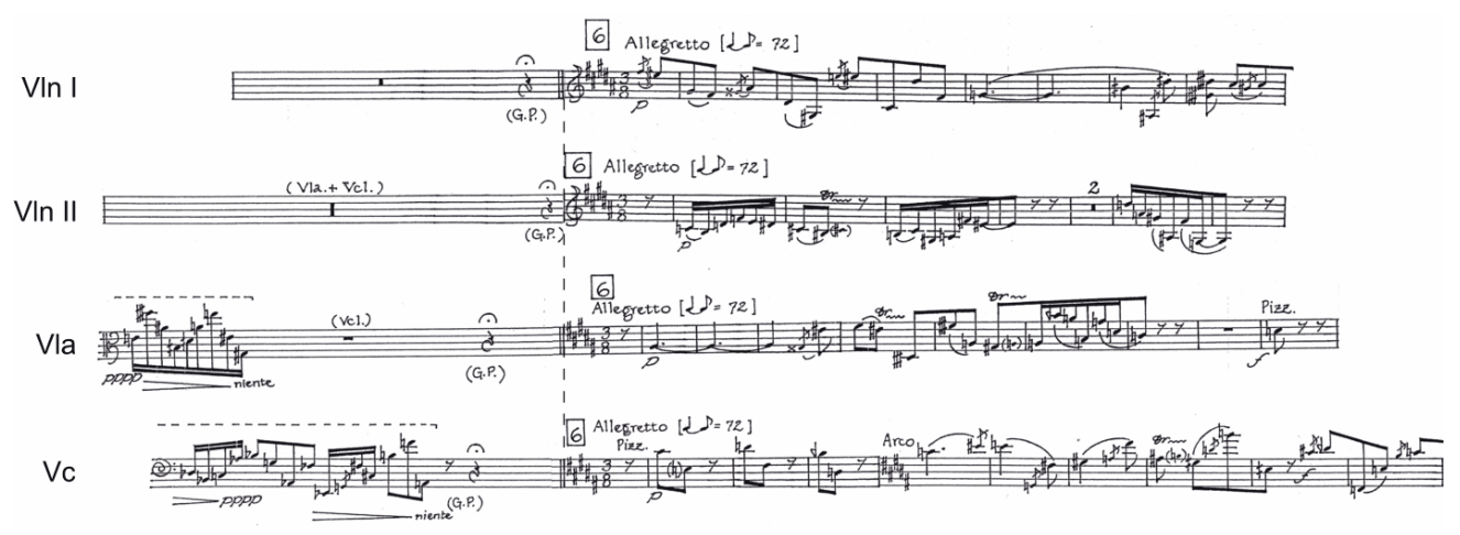
Example 5. ©Michael Finnissy, 2007, used with permission

In contrast to the meaningful coincidences of the 'minuet' and 'trio' sections, it was clear to the players that the asynchronous material that forms the majority of the piece must have at one stage been mapped out in such a way as to ensure that the individual instruments cannot pull too far apart from one another. The large-scale structural push and pull between the parts that is activated by the absence of a full score thus becomes a kind of counterpoint that might appear too tightly 'boxed in' if scored explicitly. As notated, this structural counterpoint becomes an important complement to the local expressive polyphony resulting from each player's avid pursuit of his own path.