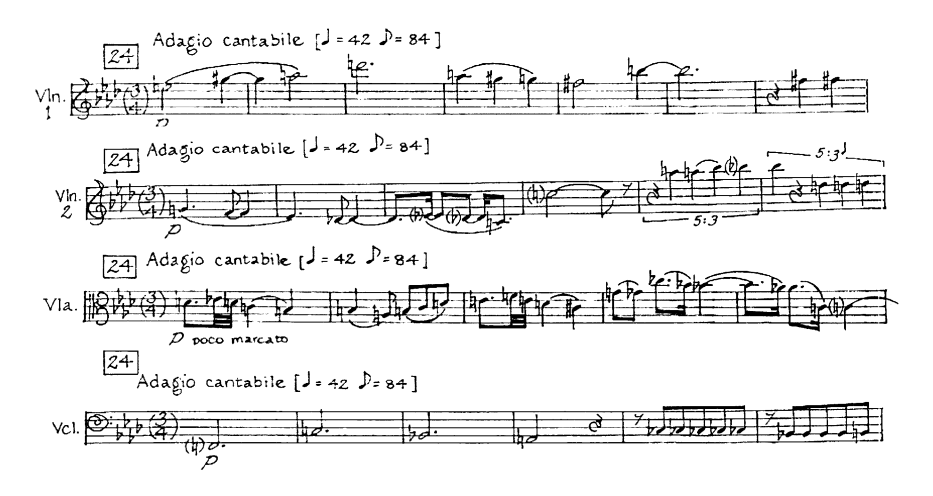
Example 1. ©Michael Finnissy, 2007, used with permission

An example of the way this tension is conveyed can be seen in Example 1 from [24] showing the four individual parts.