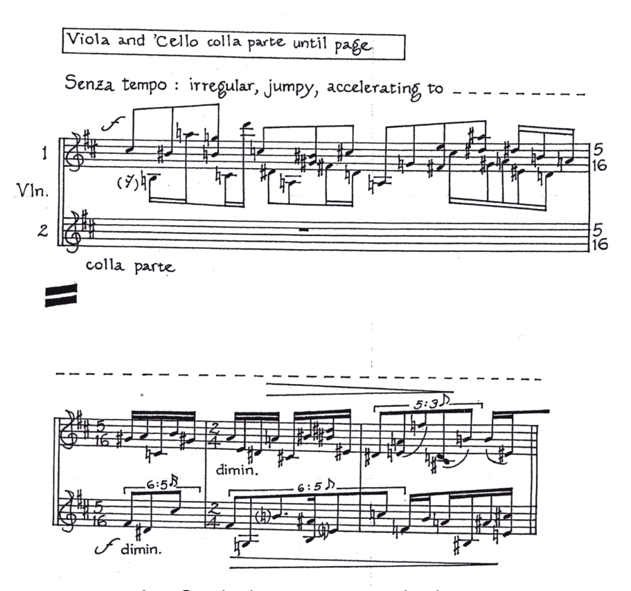
Example 3. ©Michael Finnissy, 2007, used with permission

Was it a sound I was hearing? I guess it was. It was a kind of sound action that I was hearing which was a lot like two-part counterpoint... and I struggled a bit to find a way of transcribing it in notational form [...] Only the violins have it [...] The first violin begins the piece with it. And it's a kind of conceptual two-part notation. You can't actually play very literally what it is. [...] It's not the first time I've used that kind of notation. I'd actually used it in one or two other pieces[<sup>7</sup>] as a way of expressing [...] proportional time-space notation where the relationships, for example, between quavers and semiquavers are roughly the same but not exactly the same. In other words it's not exactly in the ratio of 1:2 but sort of around that. And yet you can also see because you have these long [... beams] that link all the quavers together. That's a kind of phrasing, shaping. So it was shaping and describing certain shapes in a particular way. [...] And it was also a way of making quite fast-moving music sound quite hectic and spontaneous [...] but describing that and getting the physicality of it in the notation. There are lots of different ways you can do it. And this way seemed [...] good for this particular piece (interview with Bayley, 4 February 2007).