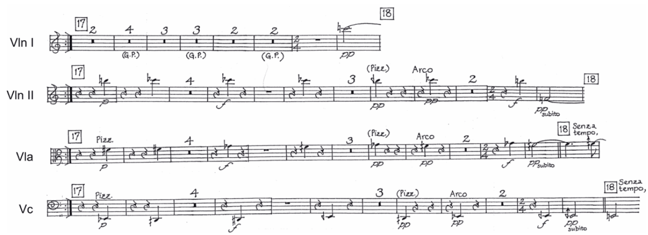
Example 6. @Michael Finnissy, 2007, used with permission

To conclude, the efficiency of Finnissy's notation encourages the composer and performers to focus on negotiating issues of ensemble and sound in rehearsal. The players find Finnissy's "economy of expression", as Sheppard Skærved calls it, helpful because it gives them licence for interpretation. As Finnissy himself points out, providing the players with "too much information" can be unhelpful; he is reluctant to be over-prescriptive, preferring to leave open possibilities for alternative interpretations. On the one hand, more verbal instructions in the score could have been useful for helping the players to coordinate their transitions between different sections. On the other hand, their inclusion might have meant the players would not have raised so many questions that elicited such useful responses from the composer. Thus a strong case can be made for composers to give as much, if not greater, consideration to the instructions they leave out of the parts (or score) as to those they include. The effectiveness of the delicate balance achieved between inclusion and exclusion is, however, reliant upon the enquiring minds of performers, who need to know what questions to ask just as composers need to know what answers to give. Since composer's 'answers' have to precede performers' 'questions', the exciting and creative nerve-centre of interpretation lies at the intersection between the two.