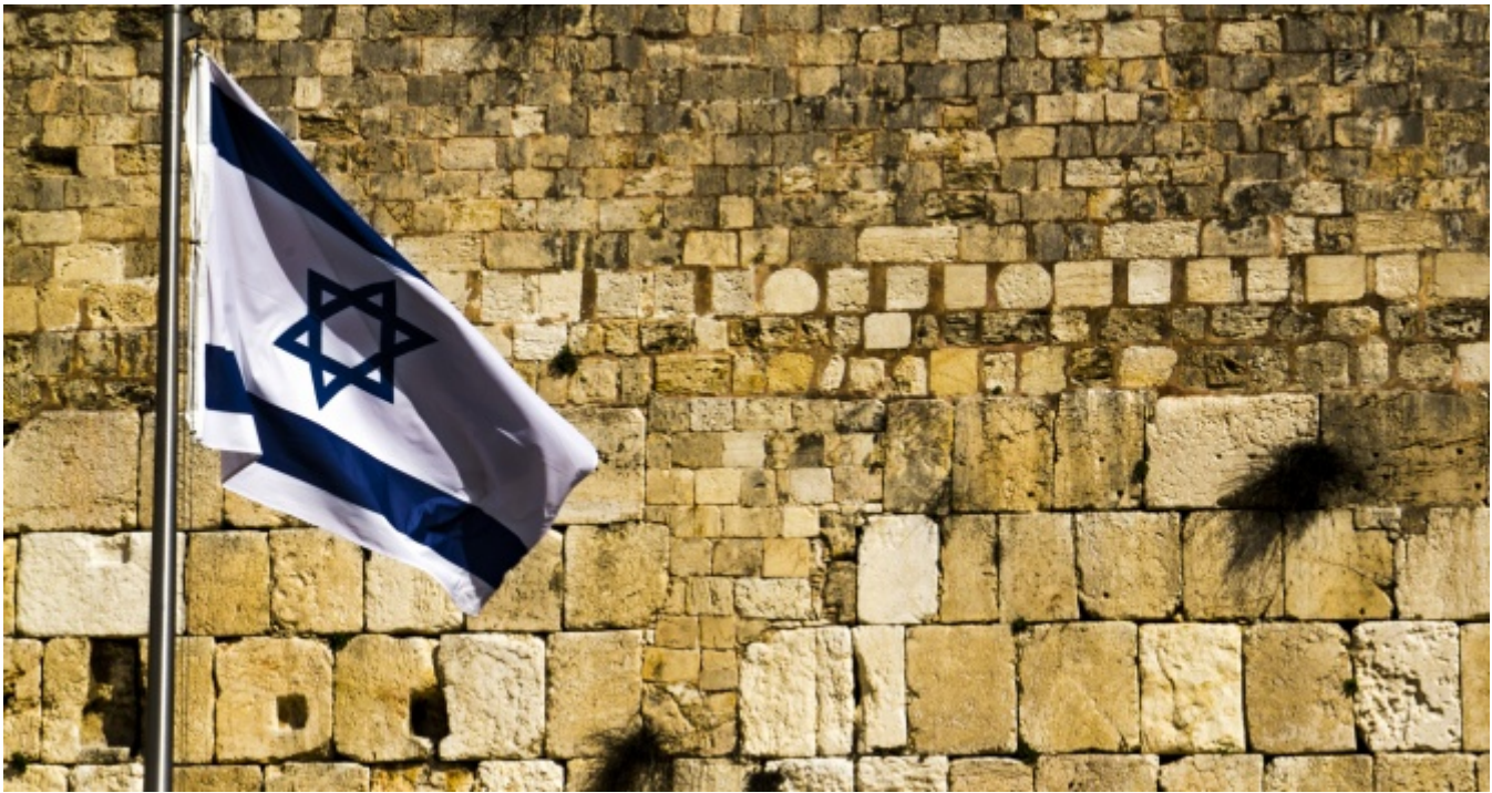
“Flag on the Wall.”

I flew on a jam-packed plane back to London from Tel Aviv airport. The airport is out of bounds to Palestinians living in the West Bank. They must fly to or from an airport outside of Israel, normally at Amman, Jordan, which means that the journey from London to the West Bank or vice versa takes, instead of half a day, a minimum of one long day and can often take two full days. En route, I read a Jerusalem Post article by one of its columnists, Sarah Honig. She says: