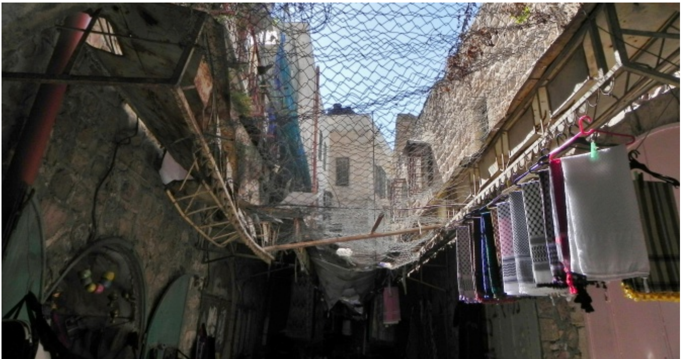
Old City, Hebron – West Bank.

The main access point to the souk had a revolving steel gate with an Israeli soldier on hand to allow or prevent access. As we passed through, two men on one side manned a stack of cartons of canned goods on a trolley; they lifted the cartons one by one high up over the top of the barrier, into the hands of two men on the other side, who lowered them onto their trolley, ready to move elsewhere. Think of the transaction costs of shifting those canned goods a couple of meters through the check-point.