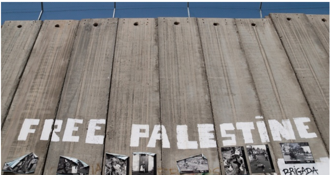
Palestine 2011. Israel's Wall in Bethlehem, West Bank.

The restrictions or choke points which the Israeli state imposes on Palestinians in the West Bank (to say nothing of Gaza, which I did not visit) are most visible in the Wall and security fence, which divides the whole length of the country, including deep intrusions into the West Bank to “annex” additional land for Israel. But as I learnt, the restrictions cover movement of people, import and export of goods and services, but also investments and access to basic infrastructure like electricity, water and sanitation.