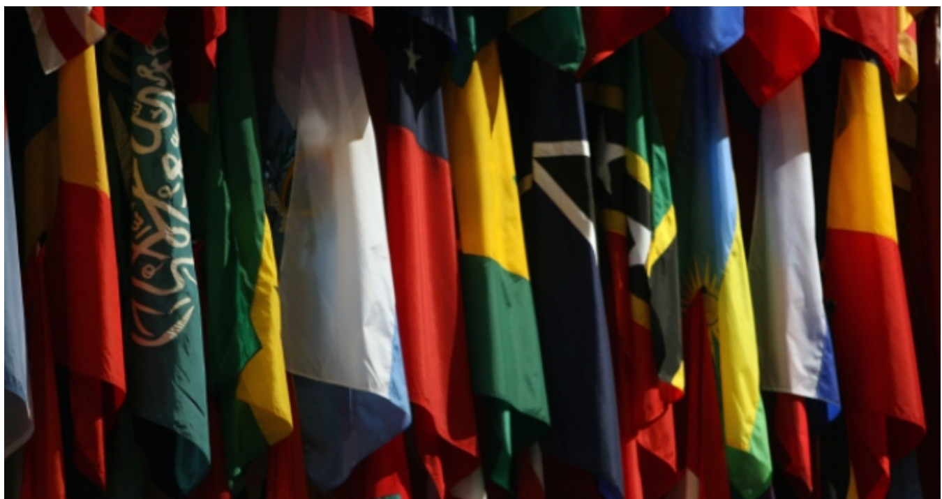
World Bank/IMF Annual Meetings 2009. Opening plenary session. Istanbul, Turkey. October 6, 2009

This system has witnessed significant changes in power relationships and policy agendas since metropolitan powers began aid programmes in the 1920s and 1930s to strengthen their economic relationships with their colonies. (Brett, 1973) The modern aid system was created in the 1940s by the USA, the IMF and World Bank to deal with post-war and then post-colonial reconstruction; transformed yet again in the 1980s and 1990s through Structural Adjustment Programmes (SAPs) that globalised the neo-liberal response to the economic crisis, (Brett, 1983; 1985) and most recently with the use of Austerity Programmes in the European Union to deal with 2007/8 crisis. Their role has been transformed again by a series of high-level agreements in the 21 st century, negotiated that produced the Millennium Development Goals (MDGs) in 2000, the Paris Declaration on Aid Effectiveness in 2005, and the Sustainable Development Goals in Addis Ababa, and Paris Climate Change Agreement in 2015.