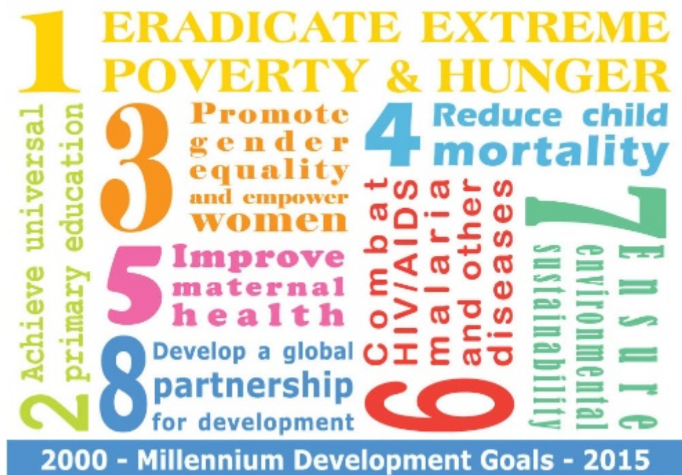
Millennium Development Goals Postcards

These agreements are a response to the political and economic conflicts generated by SAPs in the 1990s and by the recessions, wars, terrorism, humanitarian emergencies, mass migrations and intensifying environmental degradation that have dominated the 21 st century. They do include a strong commitment to poverty focussed policies, a shift from the fundamentalist neo-liberalism of the 1980s and 1990s, and an attempt to increase the bargaining power of recipient countries in aid negotiations. We cannot over-estimate their importance since these multiple crises clearly threaten us with a return to the ‘chaotic competition, monetary disorders, depressions, political disruptions and ... new wars within as well as between nations’, (White, [1] 1944/1969: 37) that followed the First World War (Keynes, 1920/2005) and was only avoided by the massive redistributive transfers that occurred after the Second.