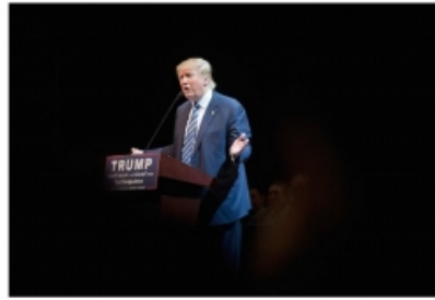
Donald J. Trump spoke during a campaign event in Fort Dodge, Iowa, on Thursday.

COMPETITION WIN £500 OF DESIGNER SHOPPING VOUCHERS WITH