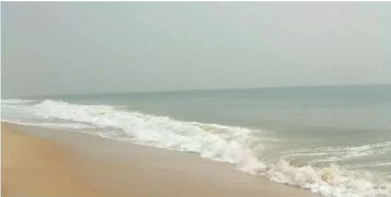
The Atlantic Ocean, Lagos, Nigeria.