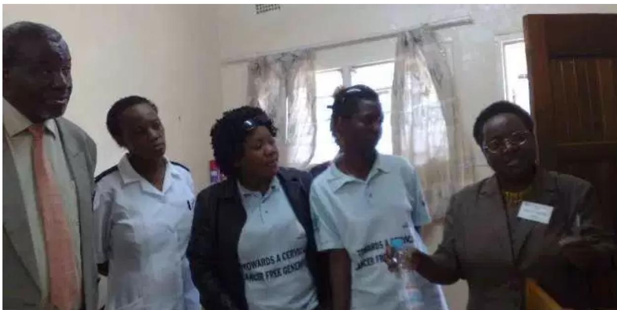
Clinic volunteers in Zambia.

informed an overarching conceptual umbrella that explicitly connected the five core theoretical issues rather than leave them isolated. They overlap in many ways, so uniting them under a single meta theoretical framework would not have been too daunting a task.