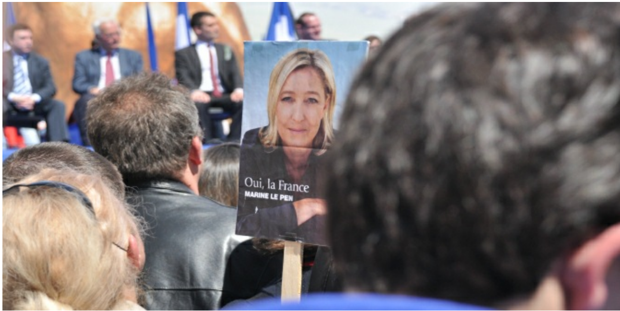
Front National Meeting, 1 May 2012

Something that might seem strange to non-specialists approaching this literature is the sheer volume of work in the reader devoted to defining the 'extreme', 'populist', 'far-' or 'radical' right. Although I have used variations of these terms interchangeably for the purposes of this review, it is a matter of some contention. While there is broad agreement running throughout the volume on the defining features of populist right-wing ideology, there is also no consensus on which parties ought to be considered in this category: UKIP, for instance, are seen as 'populist' by some contributors, but not by others.