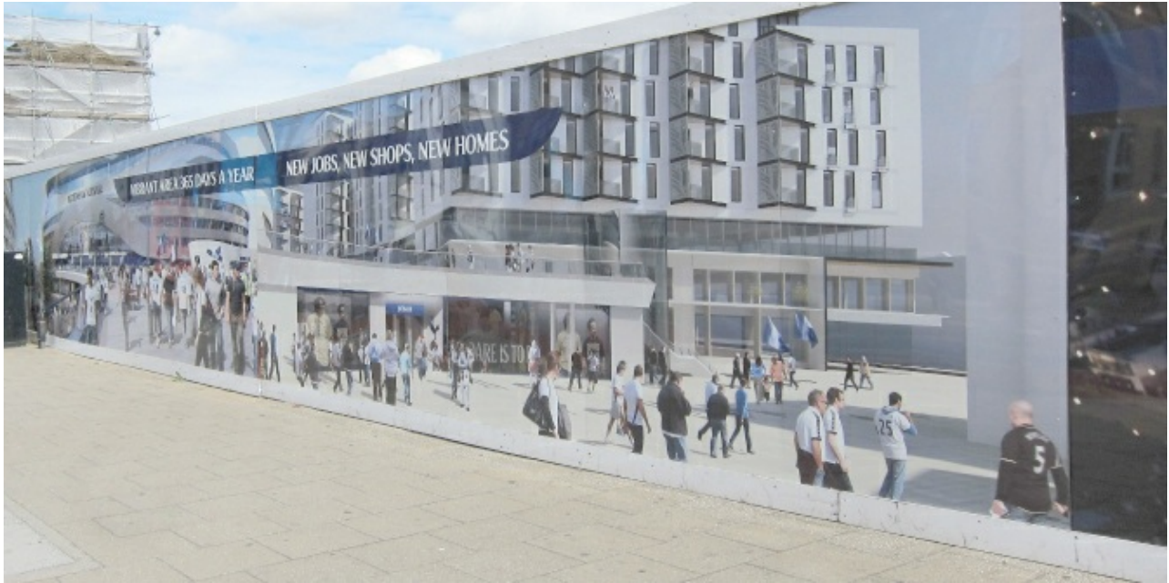
New Jobs, New Shops, New Homes

But is it only the (ex-)industrial white working class who are becoming disengaged because of the growing inequalities that characterise the new global division of labour? Guy Standing's book, The Precariat , paints a picture of societies in which many groups are being moved towards the edge through various forms of marginalisation and increased insecurities. Those changes stimulate anger, anomie, anxiety and alienation – the potential foundations for what his subtitle dubs 'The New Dangerous Class'. The precariat is not yet a 'class-for-itself', collectively seeking freedom and basic security, but is instead a 'class-in-the-making [...] increasingly able to identify what it wishes and what it wants to construct [...] an ethos of social solidarity and universalism, values rejected by the utilitarians' (181) who have created the global liberal society. Too many people are denizens, not citizens, and in his chapter on 'A Politics of Paradise' Standing sets out what he considers is needed to change to make us all citizens.