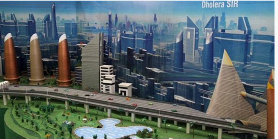
A digital rendering of the Dholera smart city catering to the highly technical imaginary of cities