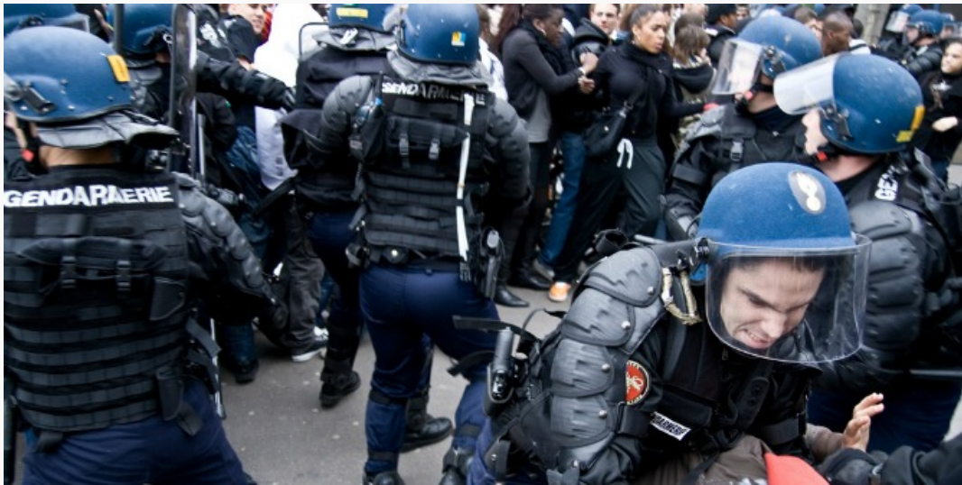
Police at a demonstration in Paris, 2008.