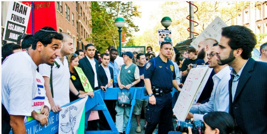
Supporters of Israel and Palestine, respectively (left to right), argue at a 700-person protest of Iranian President Mahmoud Ahmadinejad’s appearance at Columbia University in New York City, September 2007.