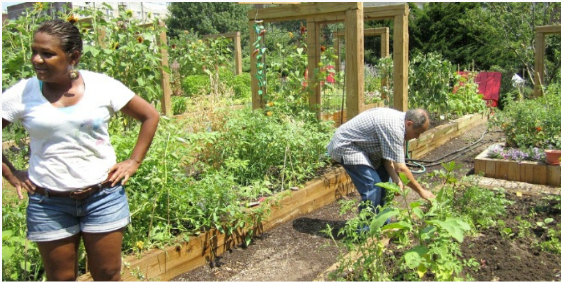
Bronx Community Garden.

The qualitative approach to defining community is persuasive and the discourse of inclusion intrinsic to community gardening welcomes the homeless, immigrants, and those with disabilities, illustrating both the challenges and benefits of these spaces. The determination of those involved with community gardens such as the Northey Street City Farm to confront and resolve issues and problems through consensus and the use of the 'gardeners' agreement' to preserve harmony is a fascinating part of the examination of the difficulties of the collective management of these spaces.