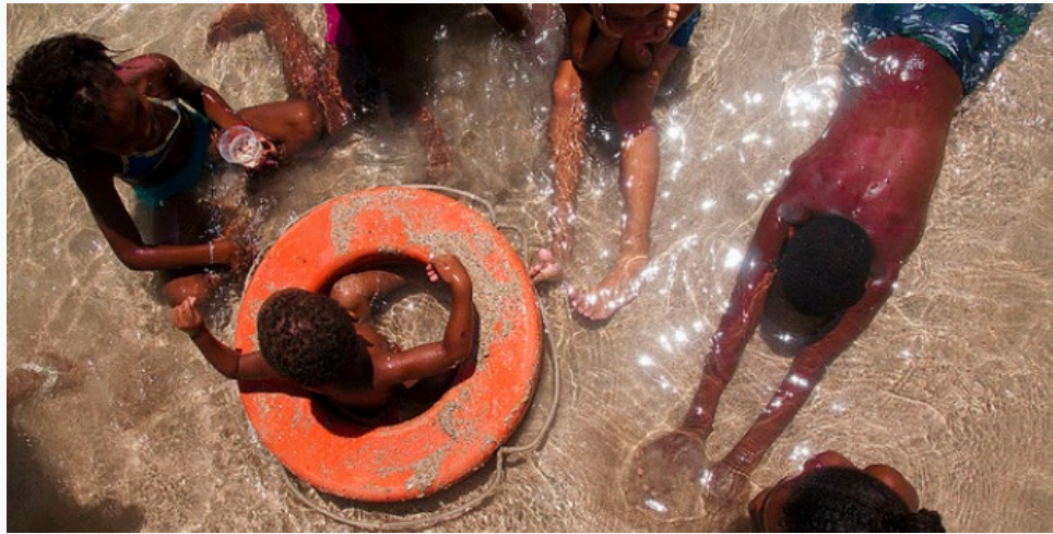
Families play in the water off Brasília Teimosa.