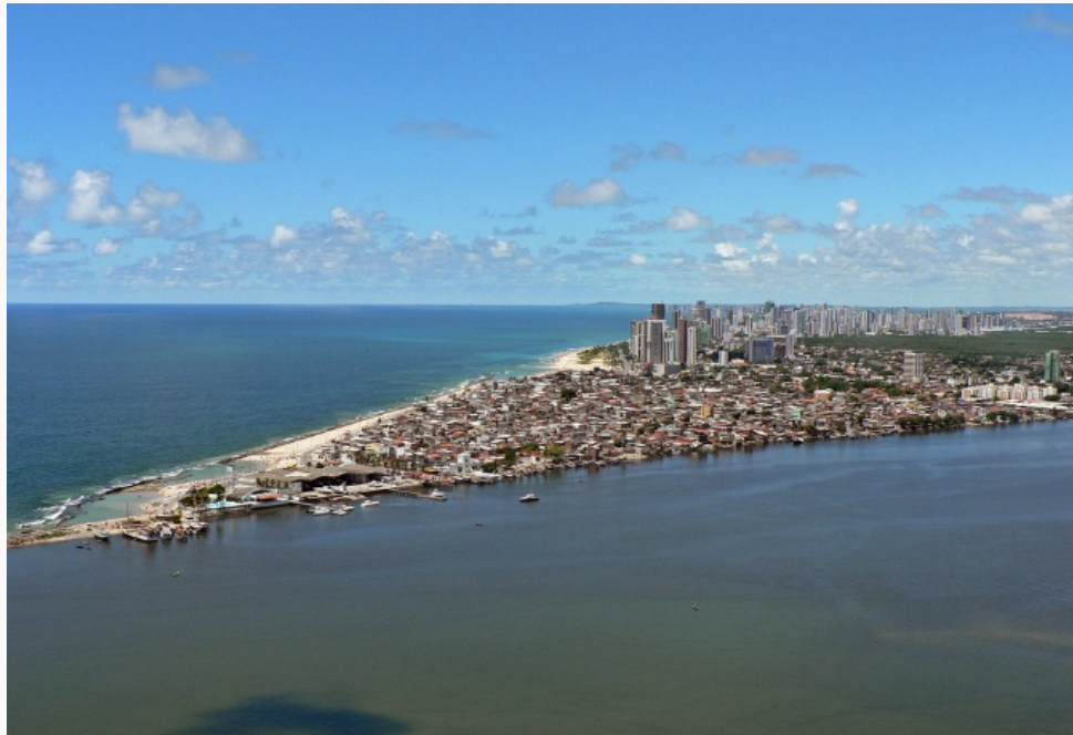
The Brasília Teimosa peninsula.

The fate of the community has been always tied to the conflicting interests of many parties. Over the years, politicians and agencies at all levels have balanced their needs to please economic interests and to manage their relationships with low-income communities. In 1934 the Brazilian President awarded land tenure rights to the State of Pernambuco, represented by the Recife Port Authority, to create an airport. In 1953 the same person granted the same rights to the Fisherman's Federation to use the site for a fishing base. In the meanwhile, the Recife Municipal Government started collecting property taxes from squatters to increase revenue, but without formally recognizing the neighbourhood, which did not even figure in the city's official maps. Technicians working in the urbanization process were often told to change their plans during political campaigns.