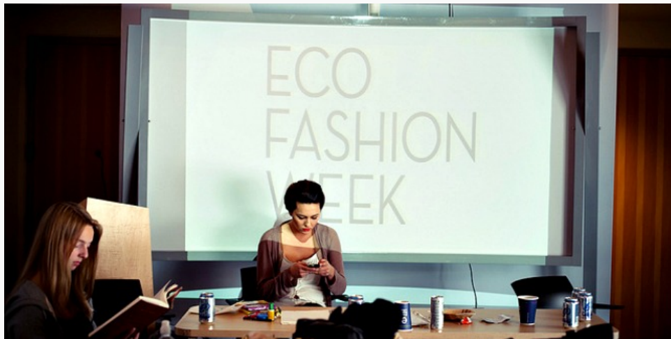
Designers prepare for Eco Fashion Week, AW 2012, in Vancouver Canada.

still struggling to meet more basic needs. In all of the cases, eco-chic, as described in the volume, is a privileged, elite activity. And across the cases presented in the book, a picture emerges of a movement whose very attempts to reduce inequality through ethical consumption is one that is only made possible, and may in fact reinforce, the very inequality that consumers are attempting to overcome.