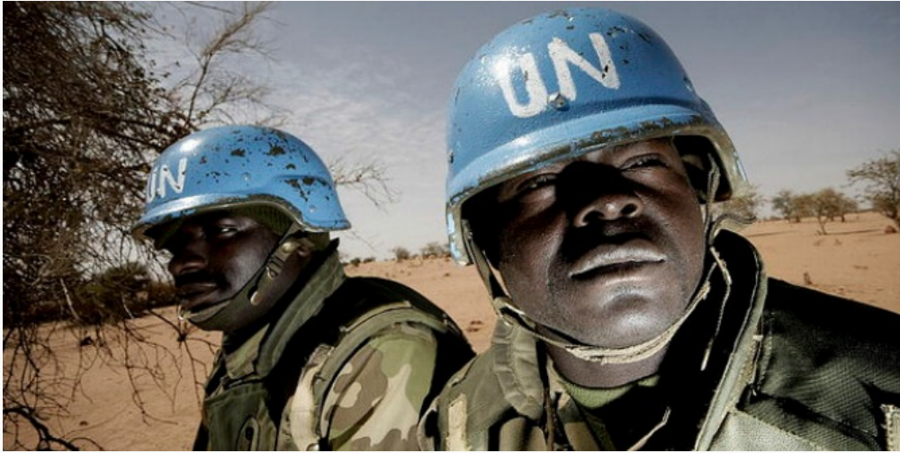
Members of the Nigerian battalion of the United Nations-African Union Hybrid Mission in Darfur (UNAMID) on patrol during a community meeting between UNAMID officials and Arab nomads. 16/Mar/2008.

Still, at the individual state's level, why do the developing countries of the South opt to participate the UN peacekeeping? The assumption of mercenarism is challenged at the opening of chapter five, examples such as Bangladesh show that earnings from UN peacekeeping is not as significant as it is believed to be. The national interests and sub-state motivations, however, seem to be more convincing explanations for participation. For instance, non-materialistic gains such as on-the-job training, exposure to war zones, experience of international deployment, the improvement of international reputation and legitimacy, and competing for regional leadership are all appealing factors of UN peacekeeping to developing countries.