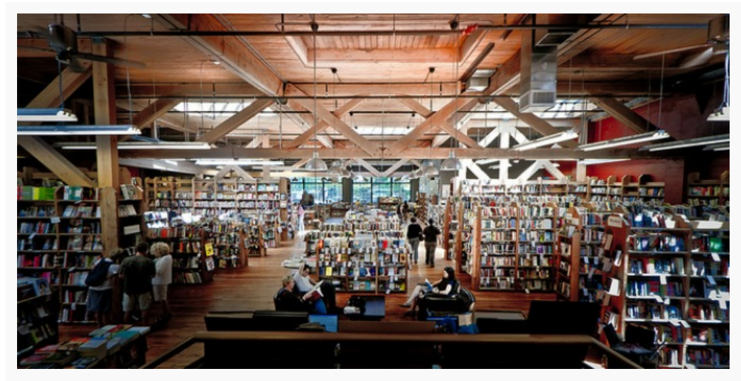
Elliott bay: Seattle's legendary independent bookstore.

The Elliott Bay Book Company, known to Seattleites as Elliott Bay, has an enormous selection of mainly new books, and is the city's most famous independent bookstore. Open since 1973, it later became the site of Seattle's first bookstore cafe, the Elliott Bay Cafe. My friends and I – and presumably most of the city – had often wandered its aisles and been held spellbound there by readings, and were thus all slightly heartbroken when it moved from its longstanding downtown location in Pioneer Square to Capitol Hill in 2010. Although the atmosphere will never be quite as dusty or magical as the original, the new location is spacious and welcoming, as is the cafe inside. In addition to hosting regular readings and literary events, the bookstore emphasises community through an impressive selection of local writing, from zines to journals to poetry. Indeed, the new Elliott Bay adds to Capitol Hill's flair while retaining its own. After many afternoons there last summer, sitting in the cafe with iced latte and freshly discovered book in hand, I realised that my struggle with Elliott Bay has never been finding something there to read but instead deciding which of the 150,000 books to take home.