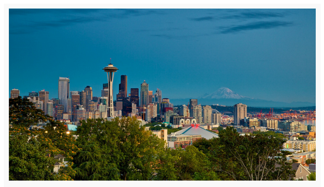
Seattle Skyline.

Although almost no type of independent business can match the number of unique coffee shops in Seattle, the city's bookstores continue to try. Despite the chain bookstore corporations, Seattle has retained at least one independent bookshop in each of its neighbourhoods which both epitomise and augment the character of these areas.