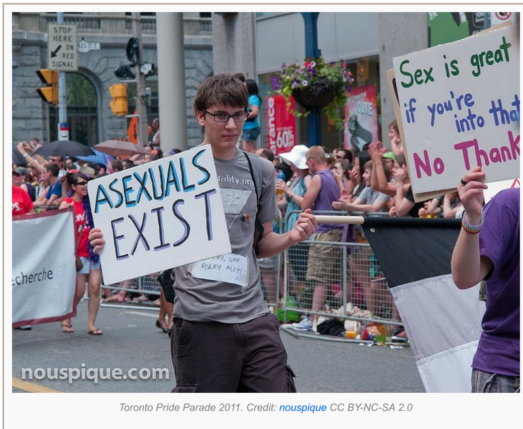
Toronto Pride Parade 2011.

A good deal of the articles are founded on the consistent genealogy of asexuality that was written by Anthony Bogaert in 2004 and this serves the purpose of unification, while at the same time the different approaches of the writers that often result in conflicting arguments work as a prism of interpretations for Bogaert's rather rigid definition of asexuality. Jacinthe Flore's piece "HSDD and asexuality: a question of instruments" appears to be the only one that directly addresses the blind spots of the narrativisation of asexuality: "Bogaert's definition of asexuality as someone who never experienced sexual attraction towards anyone at all is insensitive to issues of fluidity" (p. 45). Flore here further digs into what Yule, Brotto, and Gorzalka uncovered in the previous chapter, when she states that "by emphasising the ideology that sexual desire is natural, sexology and psychiatry have produced a discourse that stigmatizes individuals who experience low or no sexual desire, or who experience it in a way not fitting 'normal' sexuality" (p. 44). Now this might seem self-evident to devout Foucault followers, but when it comes to the notion of asexuality and the ways through which it has been narrativised, it is really a trailblazing assertion.