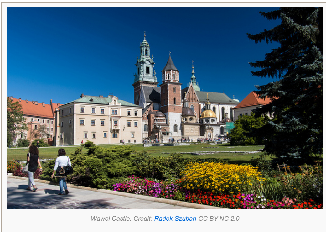
Wawel Castle.

Księgarnia Bona (literally ‘Nursemaid Bookshop’ in Polish) is a charming bookshop near the famous Wawel Castle and one of Kraków’s main streets, Ulica Grodzka. The arched ceilings and brick walls create an appealingly cavernous space to read in, and the store is a worthwhile stop when in search of a particular book or a pleasant place to have a coffee and relax. Although the English selection is smaller, there are a variety of books focusing on everything from the Holocaust and the history of Kraków to Polish cooking and tourism. While learning Polish, I often read children’s books here over large cups of peach tea, sitting in an armchair near the bookstore’s masterpiece: a large chandelier of scrolls I have always seen as Księgarnia Bona’s fitting homage to the written word.